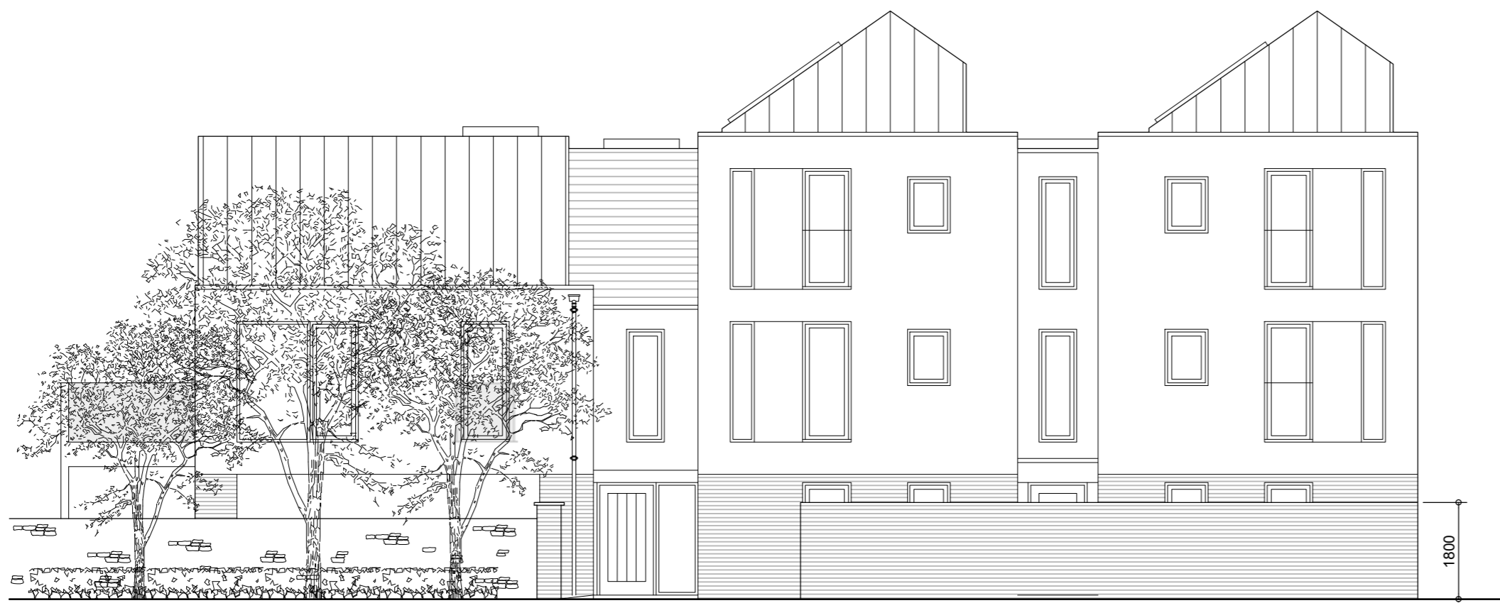
Section A-A North East Street Elevation (front)