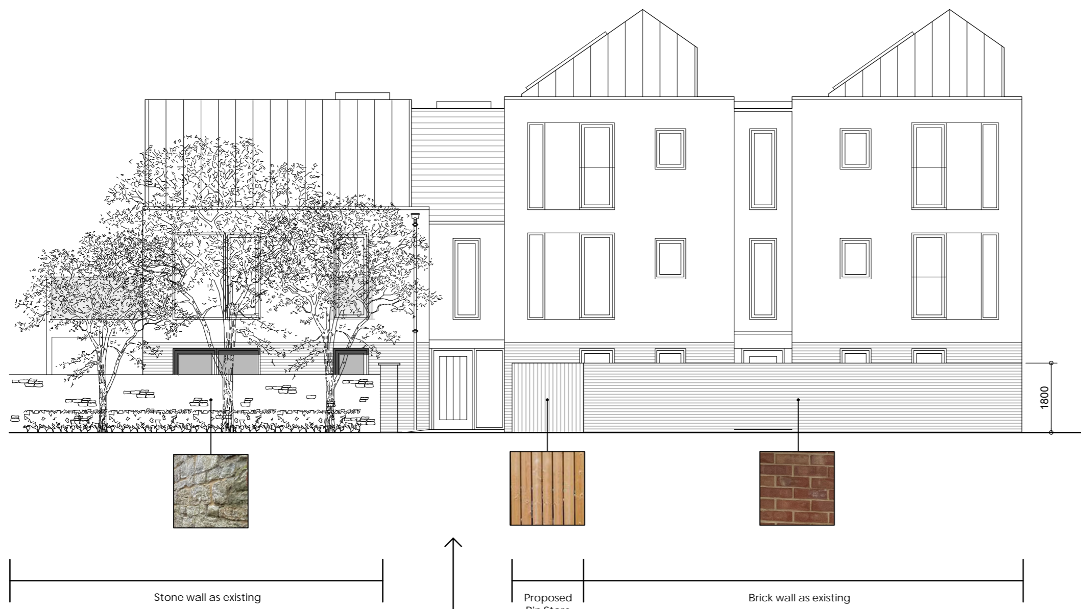
Section A-A North East Street Elevation (front)