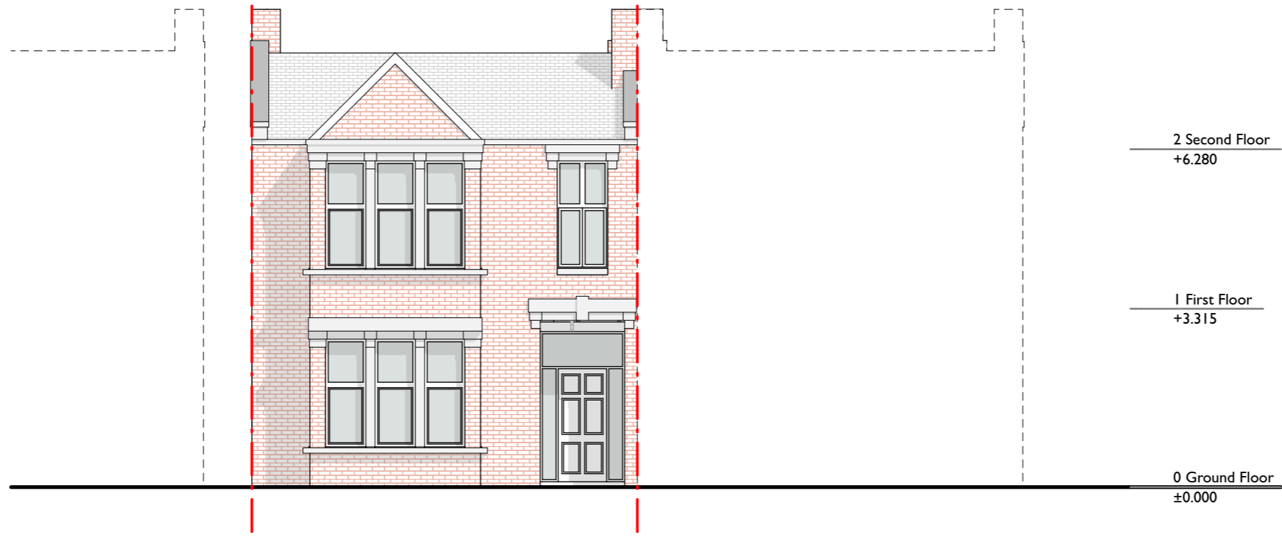
W West (Rear) Elevation scale 1:100