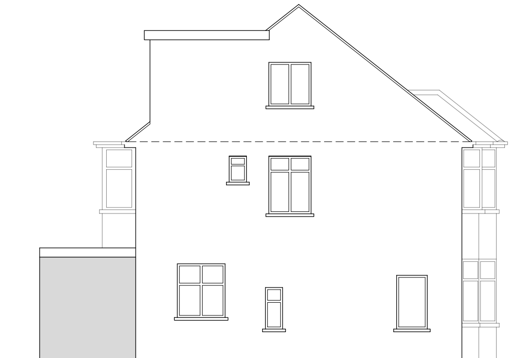
Side Elevation as built