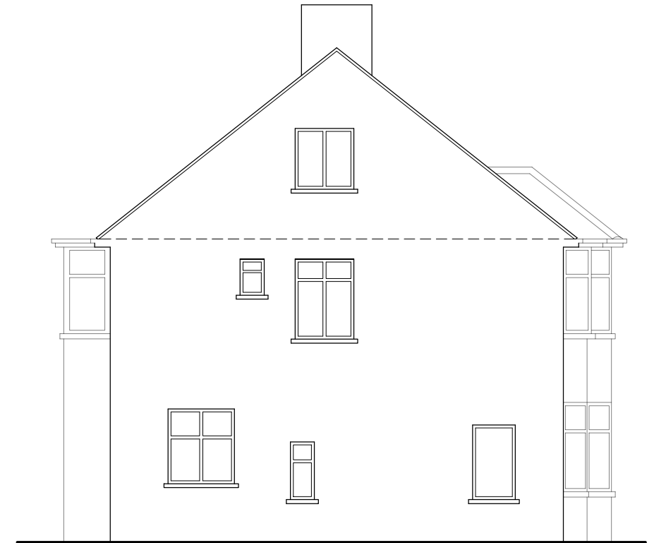
Original Side Elevation