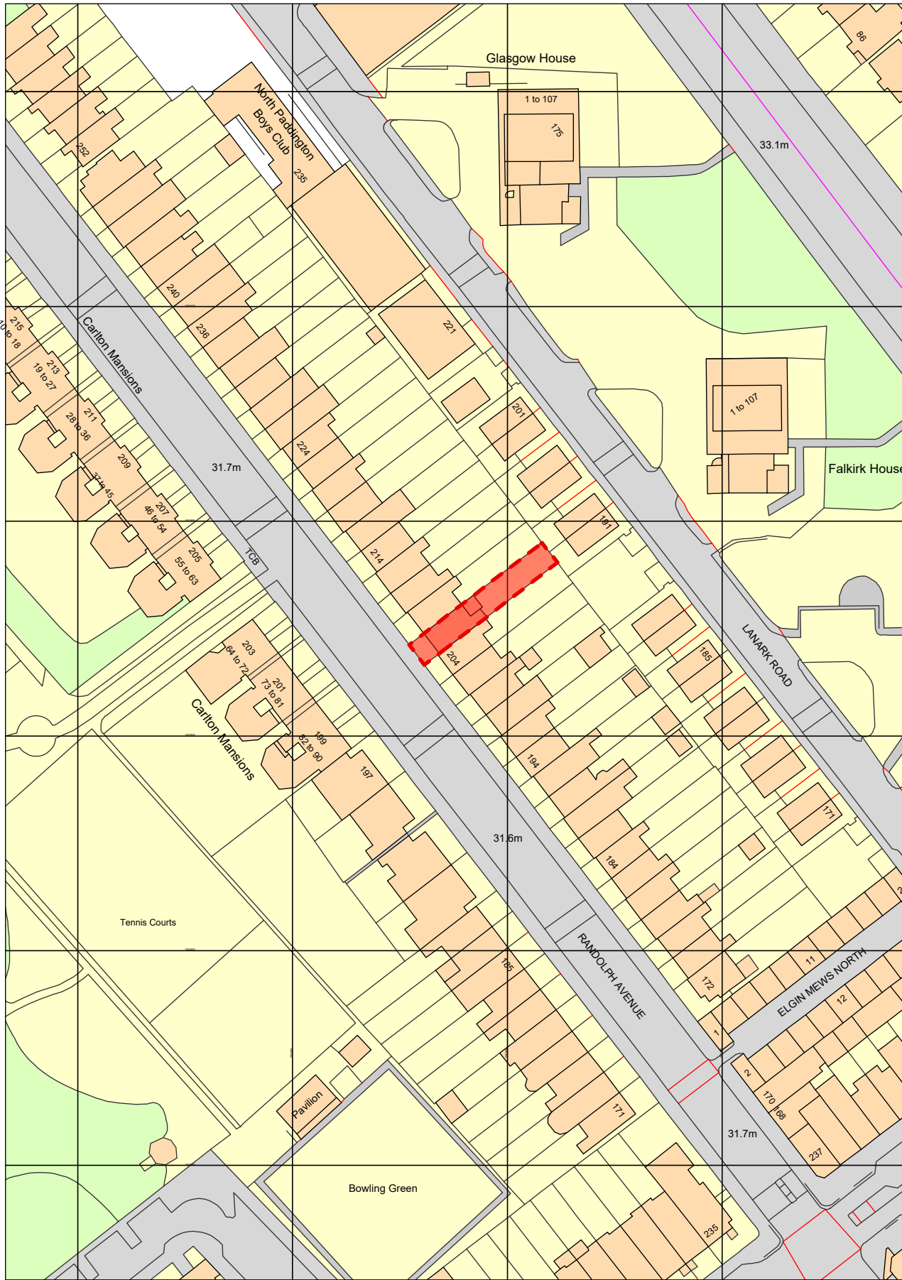
SITE LOCATION PLAN SCALE: 1:1250