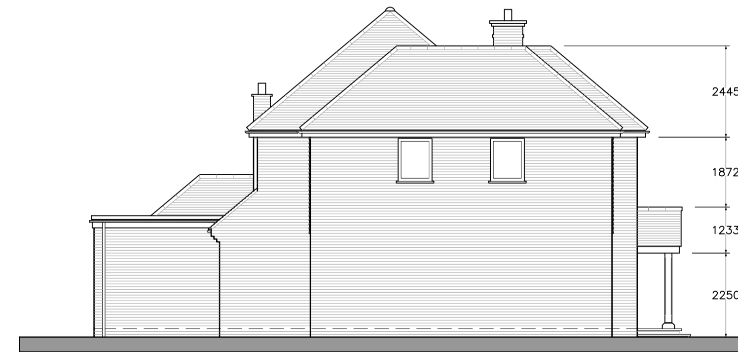
Proposed East Side Elevation