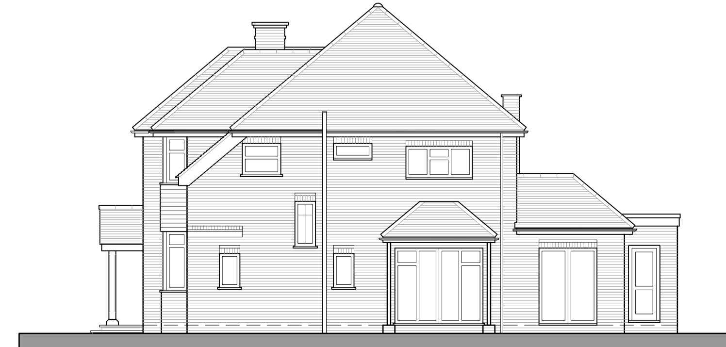
Proposed West Side Elevation – Adjacent Property – Little Hawthorns

Notes. 1 All dimensions are shown in MILLIMETRES and must be checked on site prior to the commencement of work and any discrepancy is to be reported. 2 All work is to comply with the current requirements of the Building Regulations and allied legislation. 3 All materials are to be used and installed in strict compliance with the relevant manufacturer's recommendations.