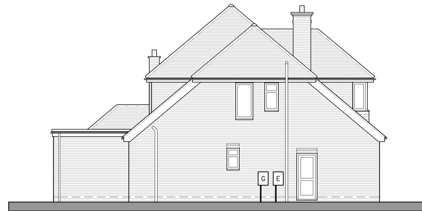
Existing East Side Elevation