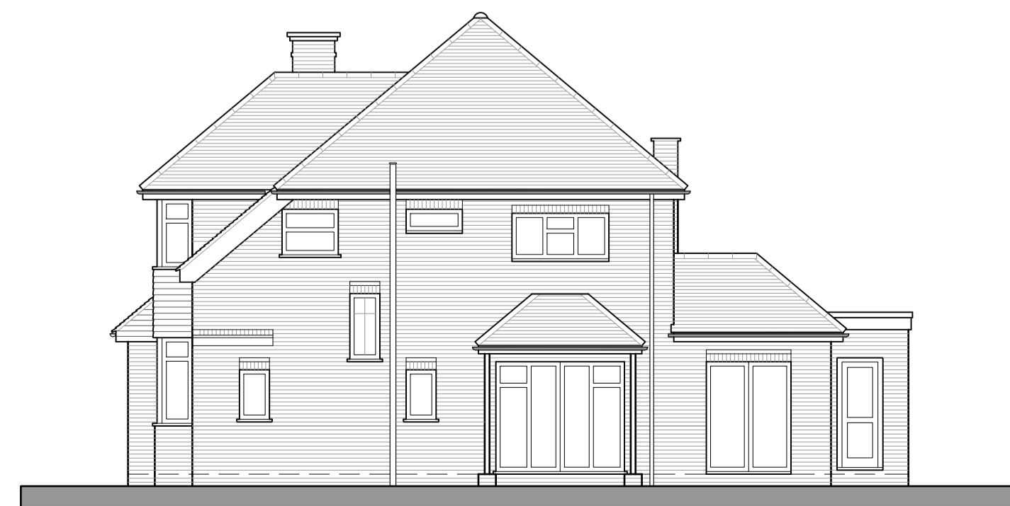
Existing West Side Elevation – Adjacent Property – Little Hawthorns