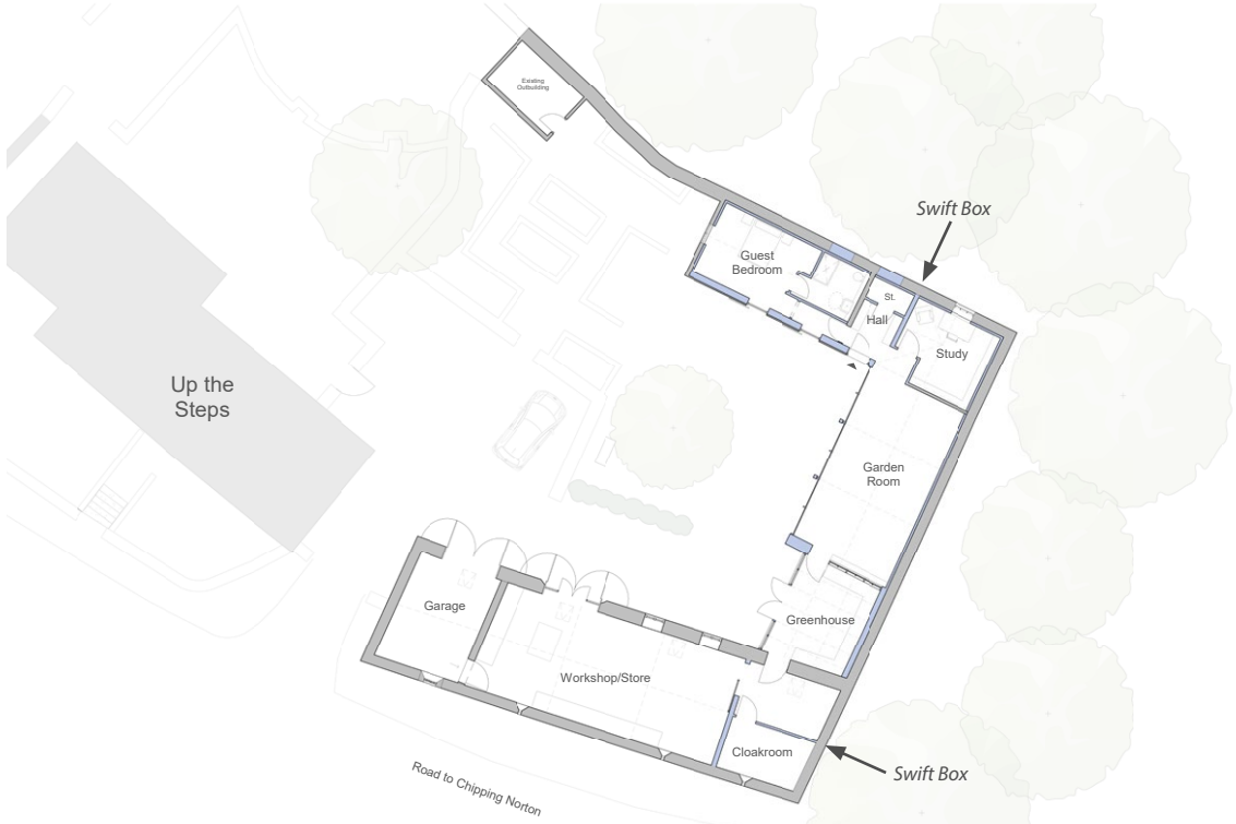
Positioning of swift boxes shown in plan