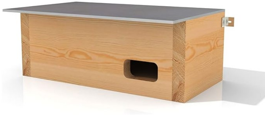
Example of type of swift box to be used

Swift boxes will be erected before the beginning of nesting season prior to May 2025.