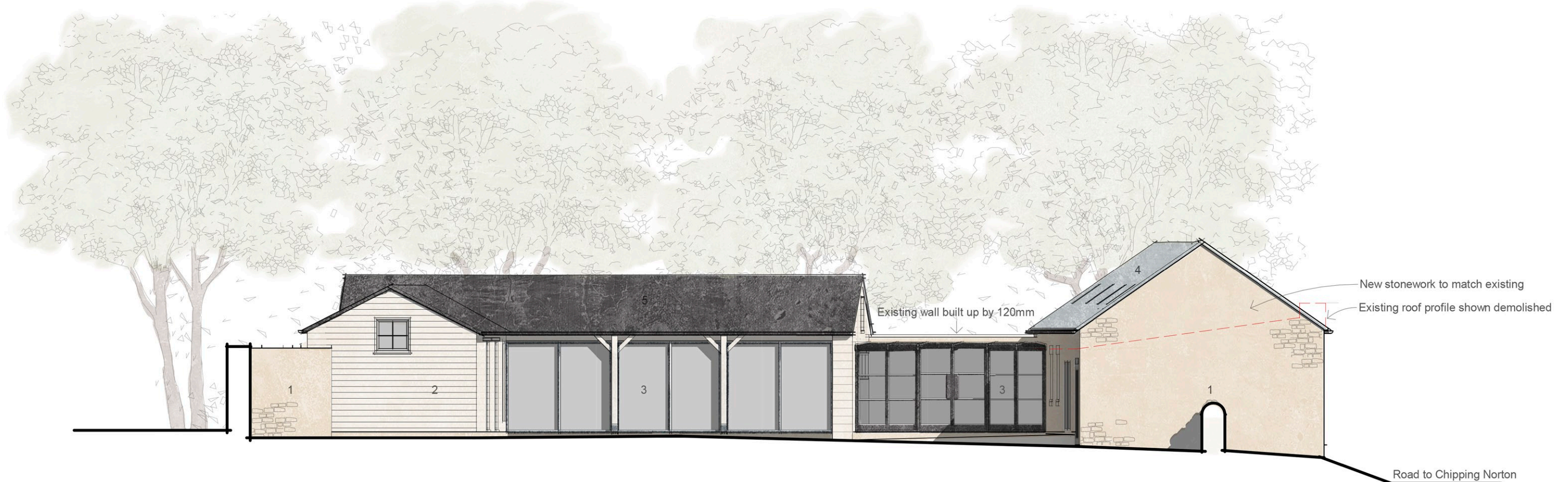
Proposed Elevation - West