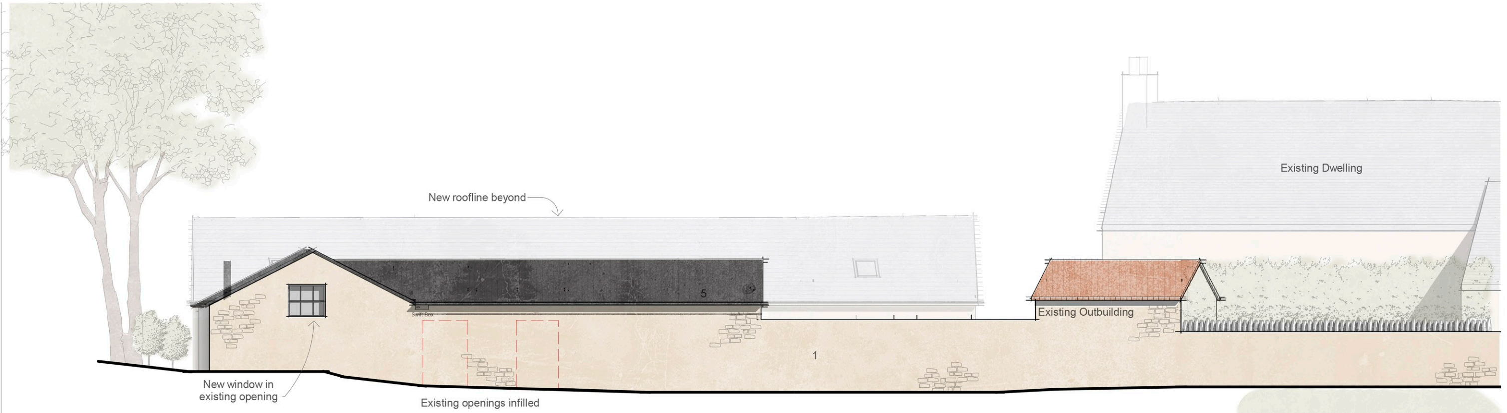
Proposed Elevation - North - Neighbour