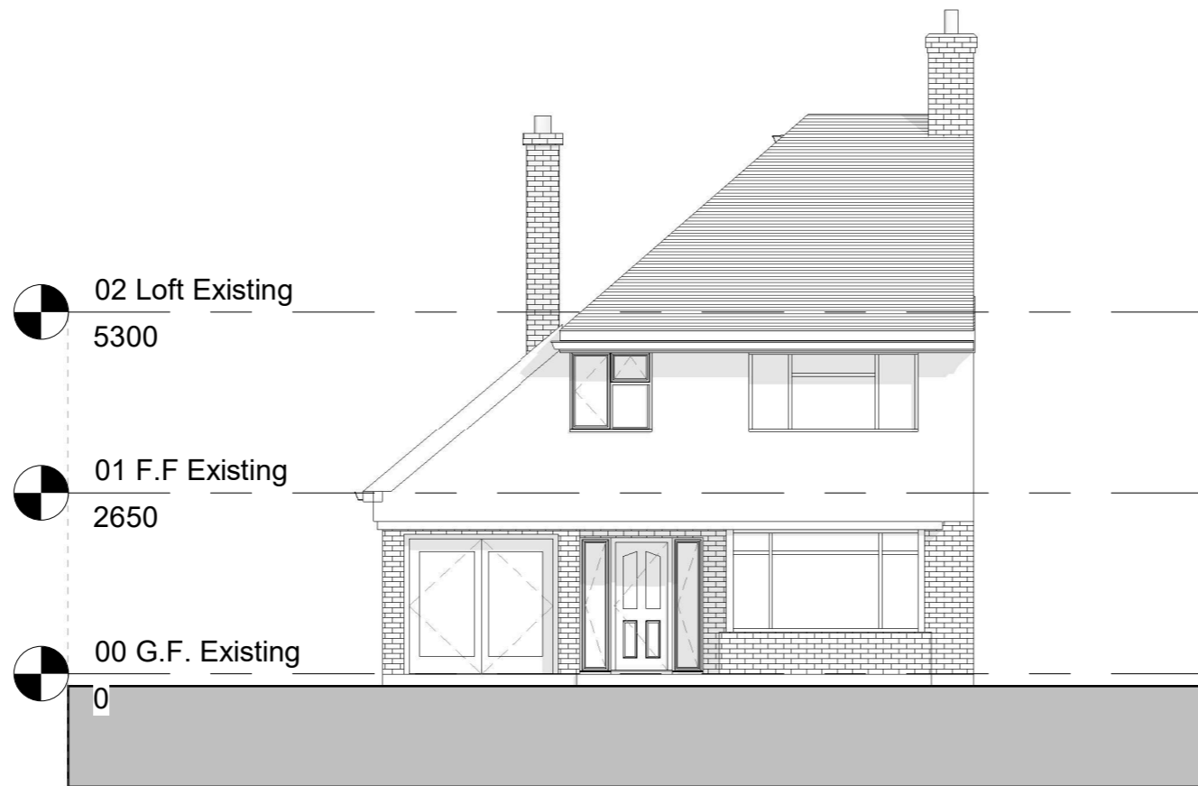
Front elevation - Existing 1 : 100

Issue Date 18/01/2024 Checked GT Revision 1