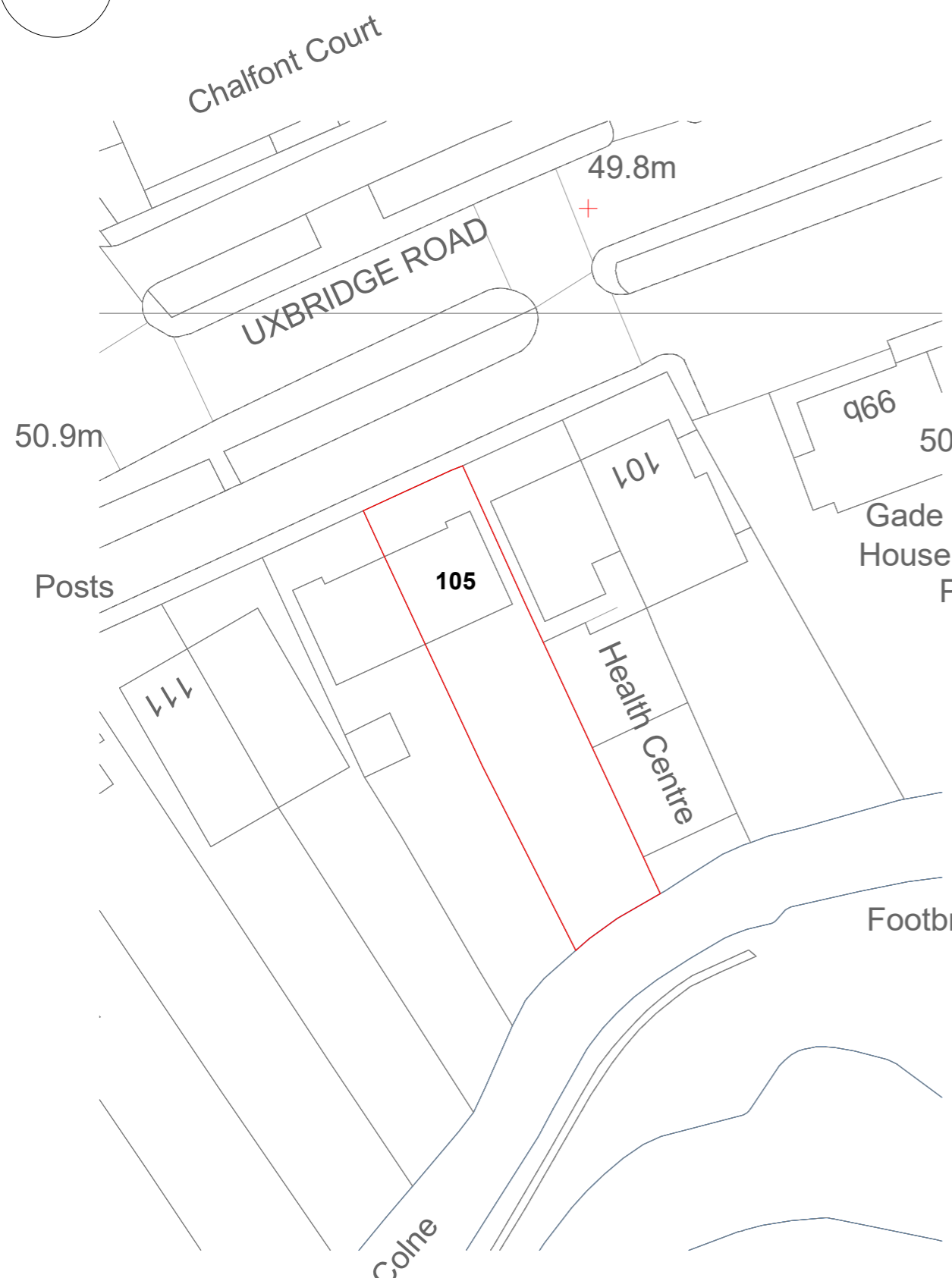
Block Plan Existing 1 : 500