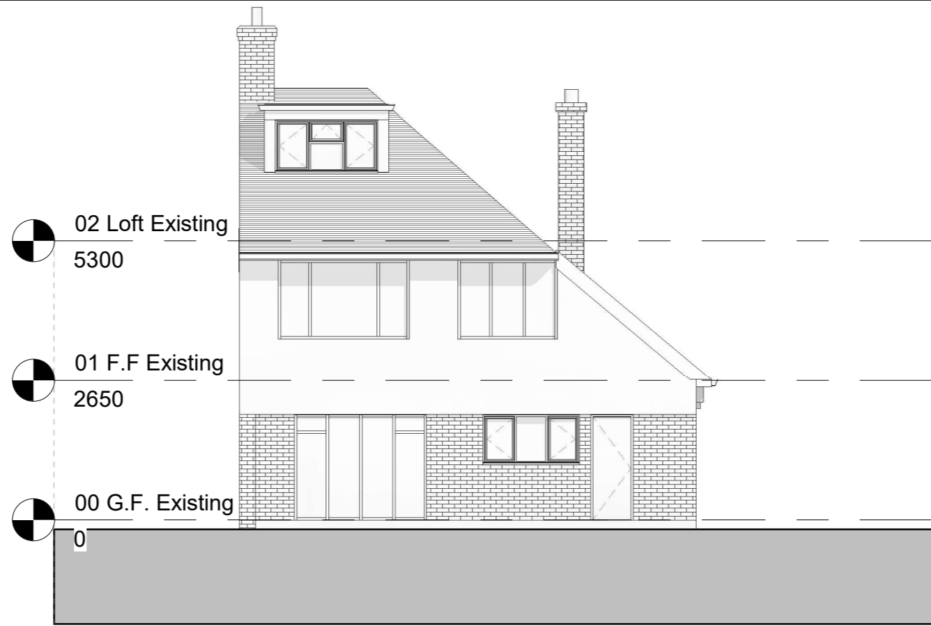
Rear elevation- Existing 1 : 100

Issue Date 18/01/2024 Checked GT Revision 1