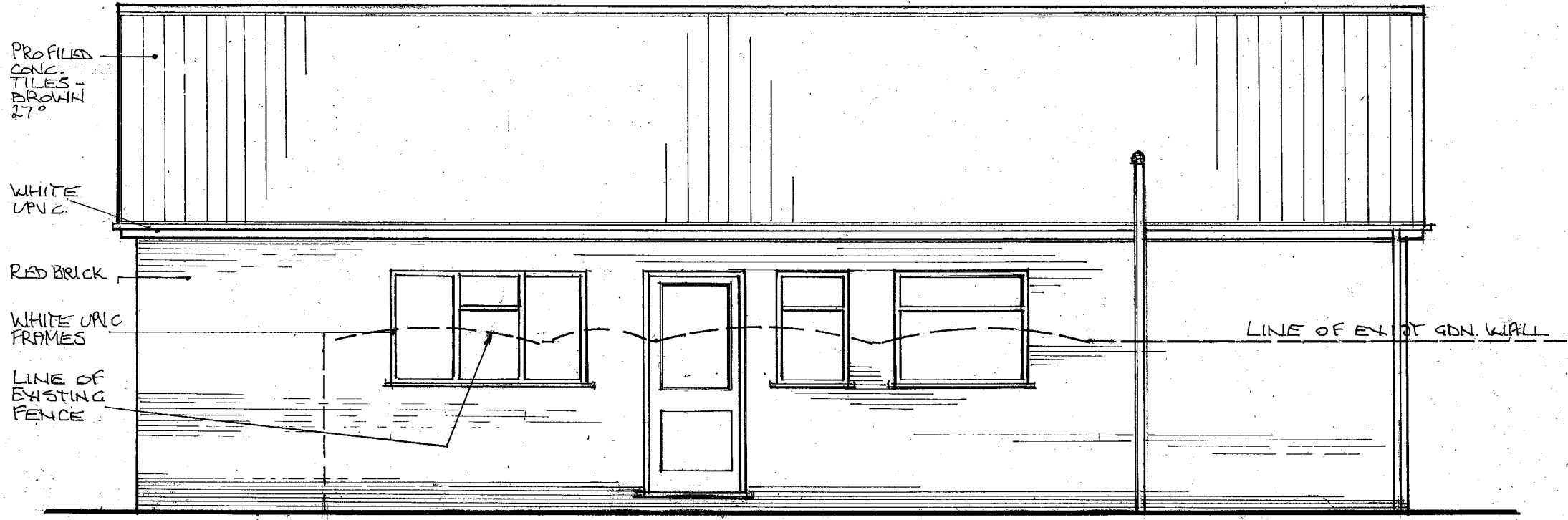
SIDE TO ROAD - EXISTING - 1:50

ALL DIMENSIONS TO BE CHECKED OUT ON SITE