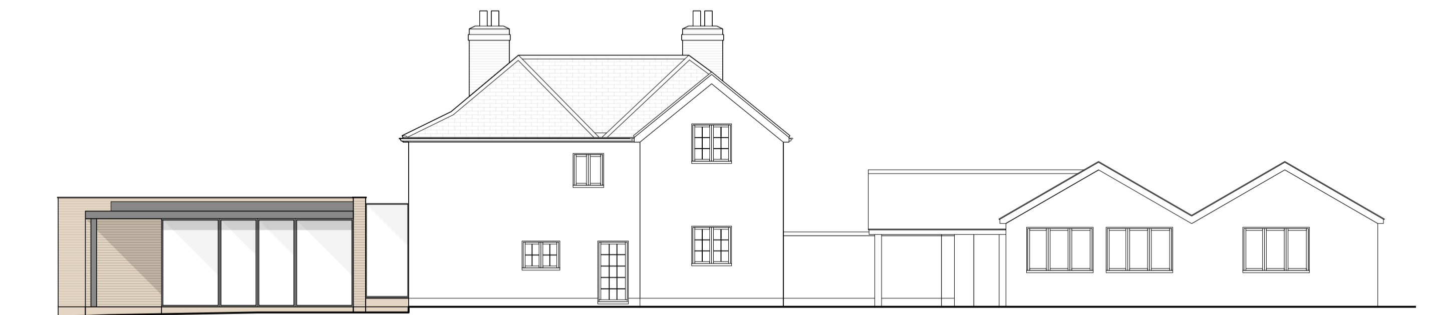
6 Proposed Rear Elevation Scale: 1:100

Information contained within this drawing is the sole copyright of EKA, and is not to be reproduced without express permission. No implied licence exists. This drawing not to be used for land transfer or valuation purposes. Do not scale from this drawing. All dimensions & levels are to be checked on site by the contractor. Issued for purposes indicated only. Drawing errors and omissions to be reported to the architect.