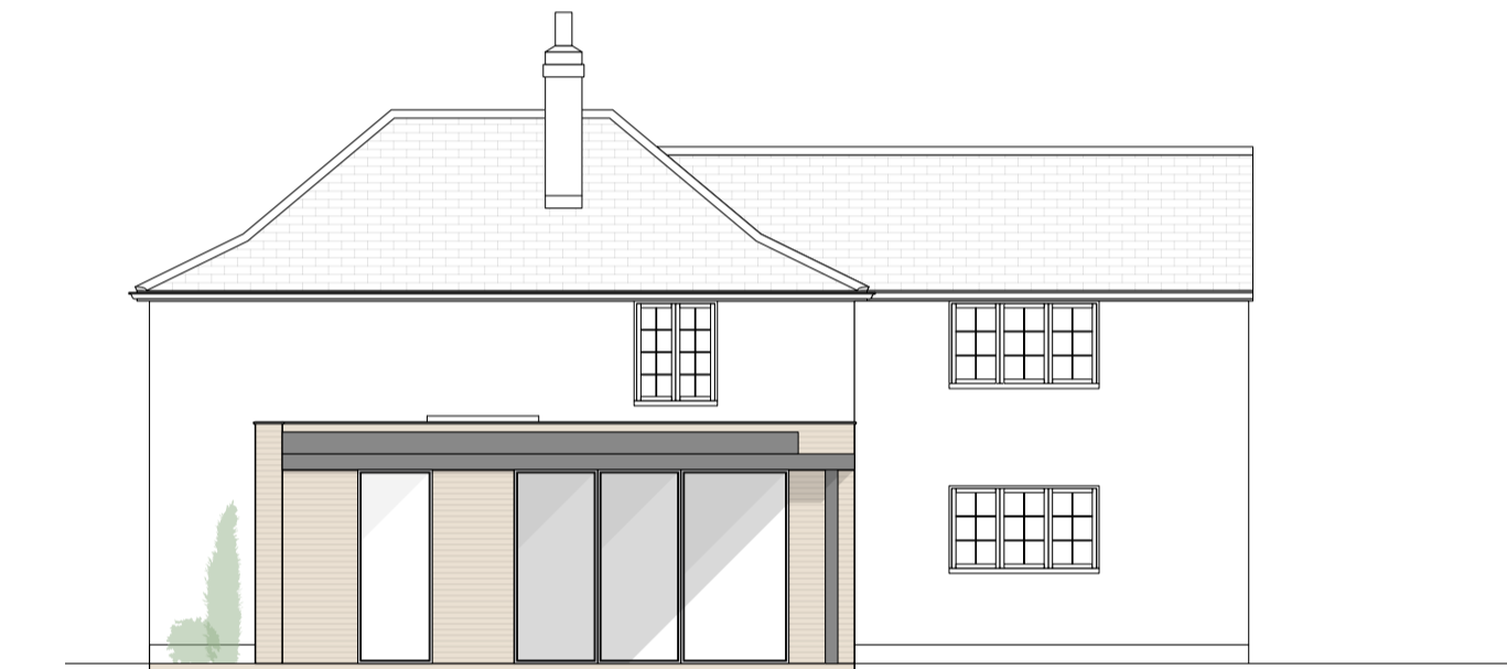
4 Proposed Side Elevation Scale: 1:100