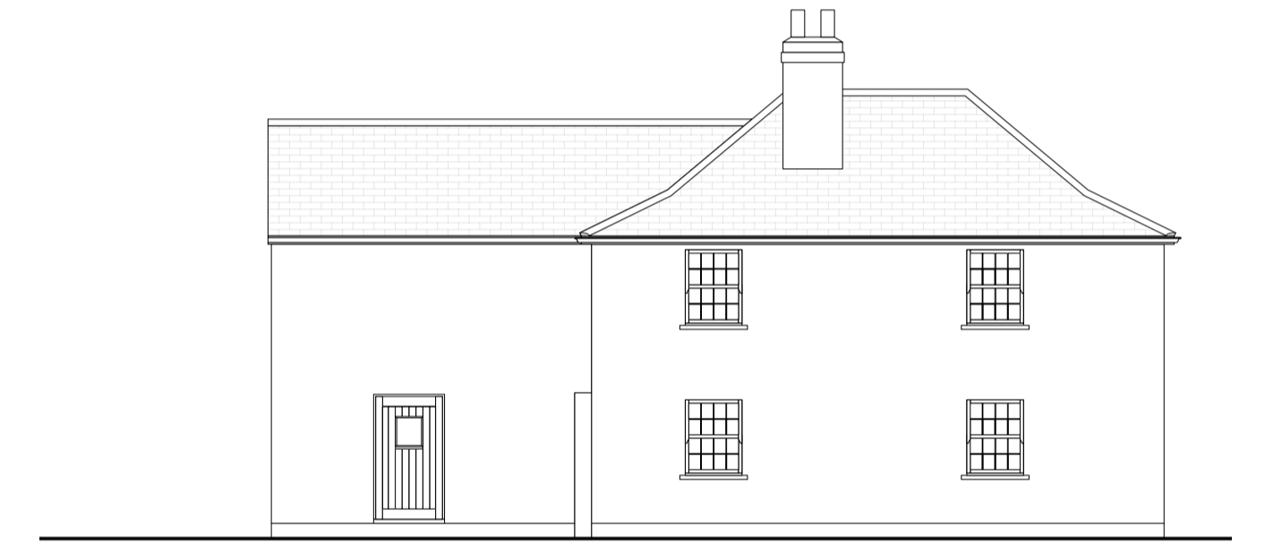
5 Proposed Side Elevation Scale: 1:100