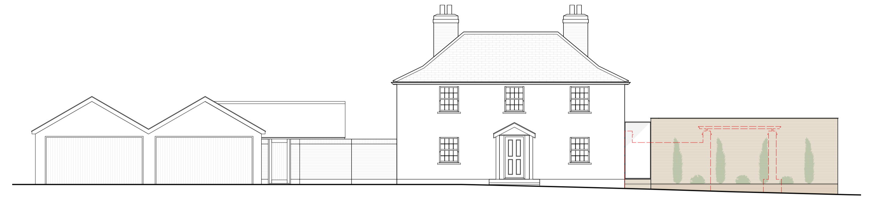
3 Proposed Front Elevation Scale: 1:100