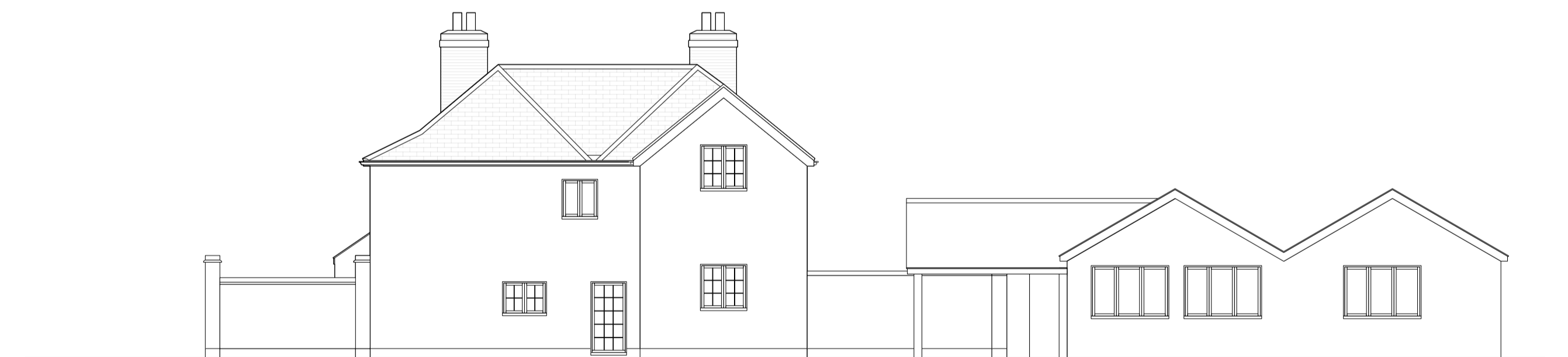
4 Existing Rear Elevation