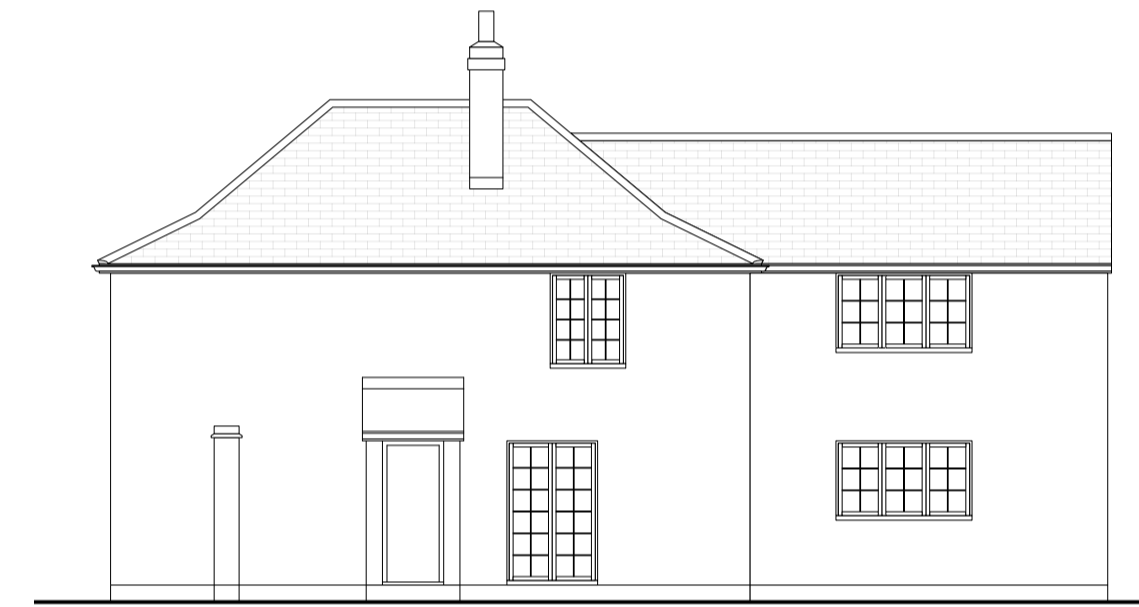
3 Existing Side Elevation