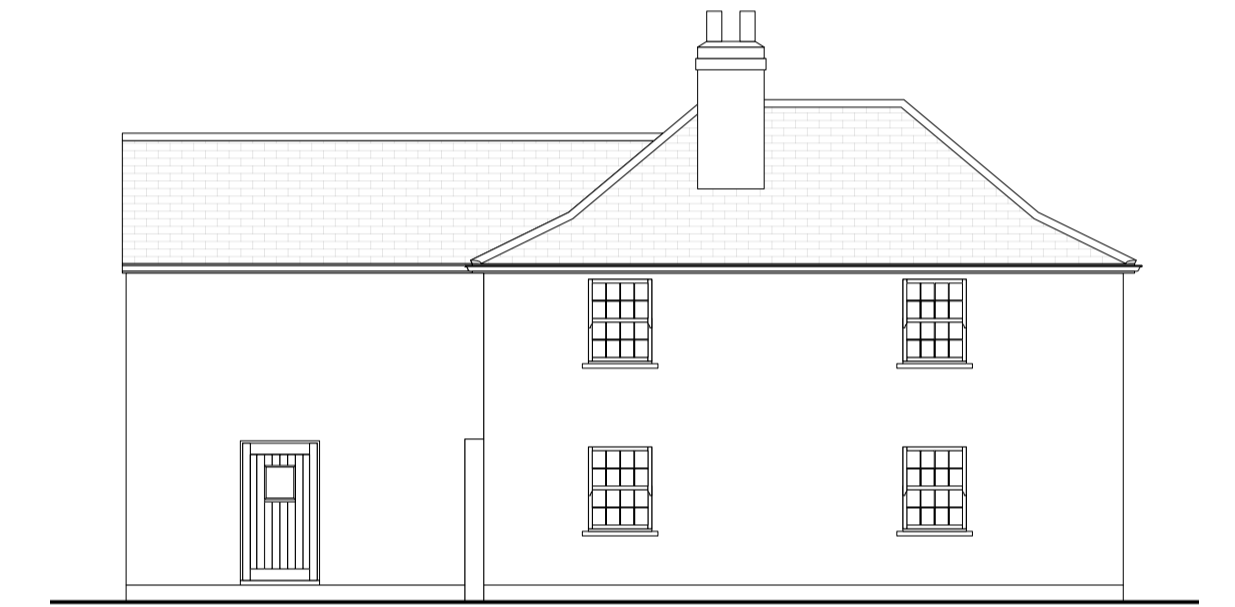
6 Existing Side Elevation