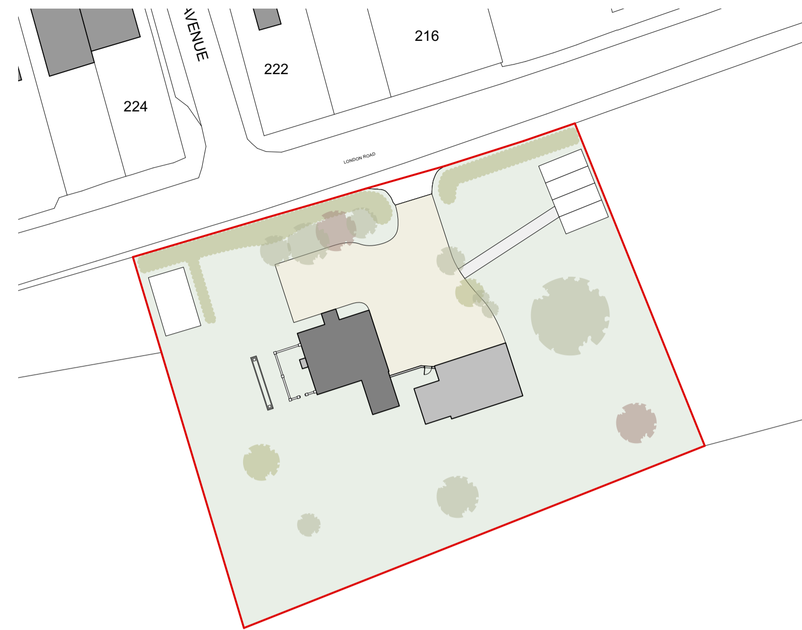
2 Existing Block Plan Scale: 1:500