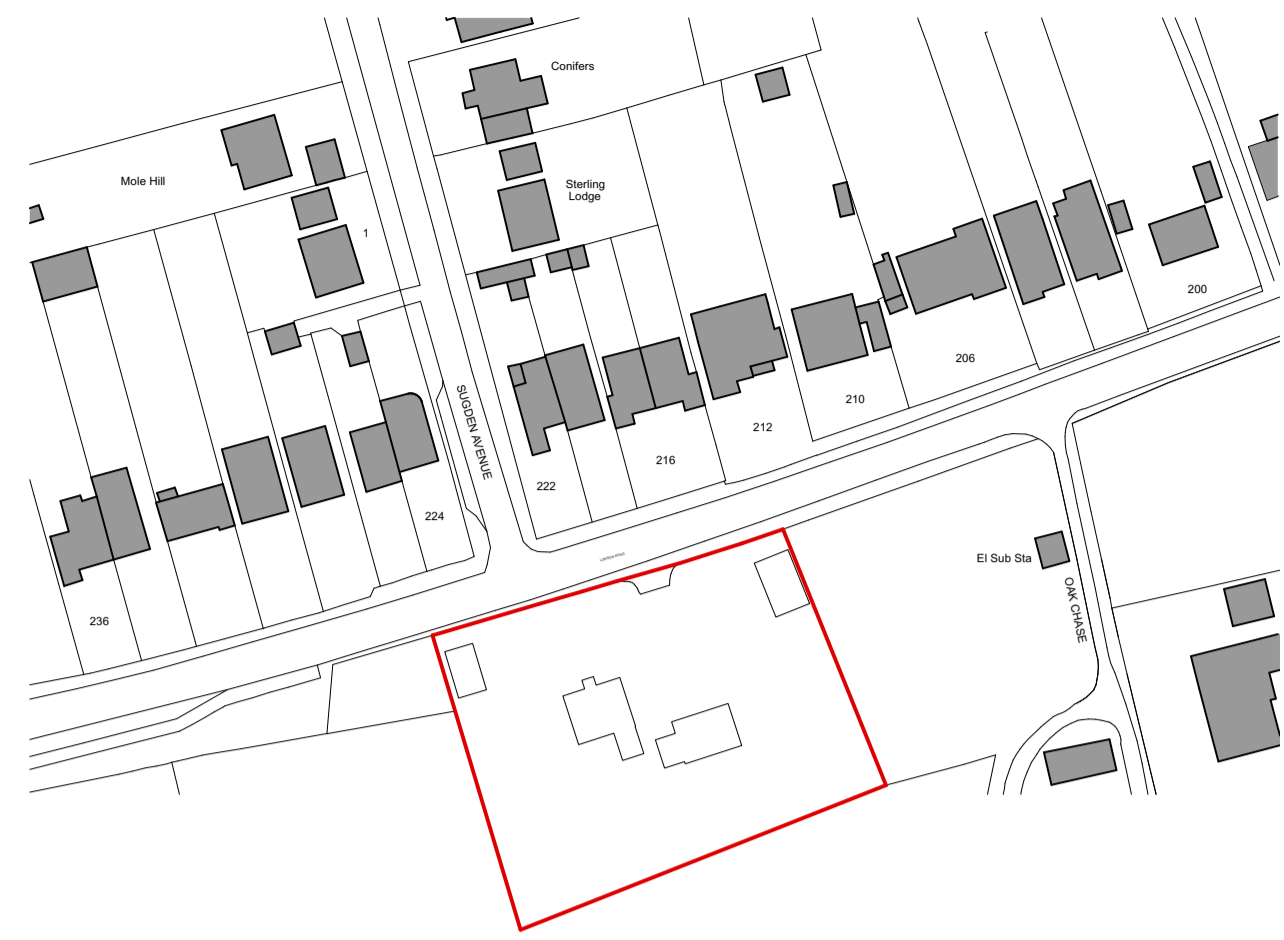
1 Site Location Plan Scale: 1:1250