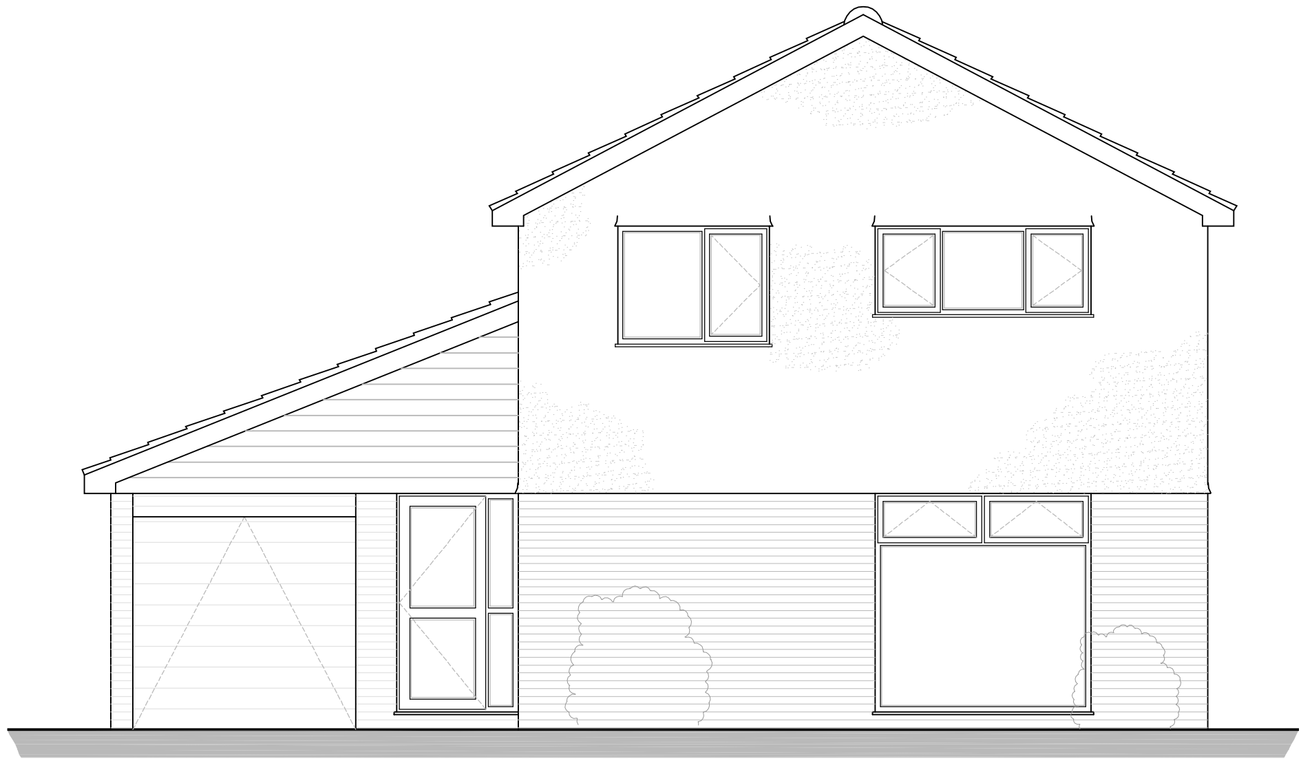
Existing Elevation Front (Scale 1:50)