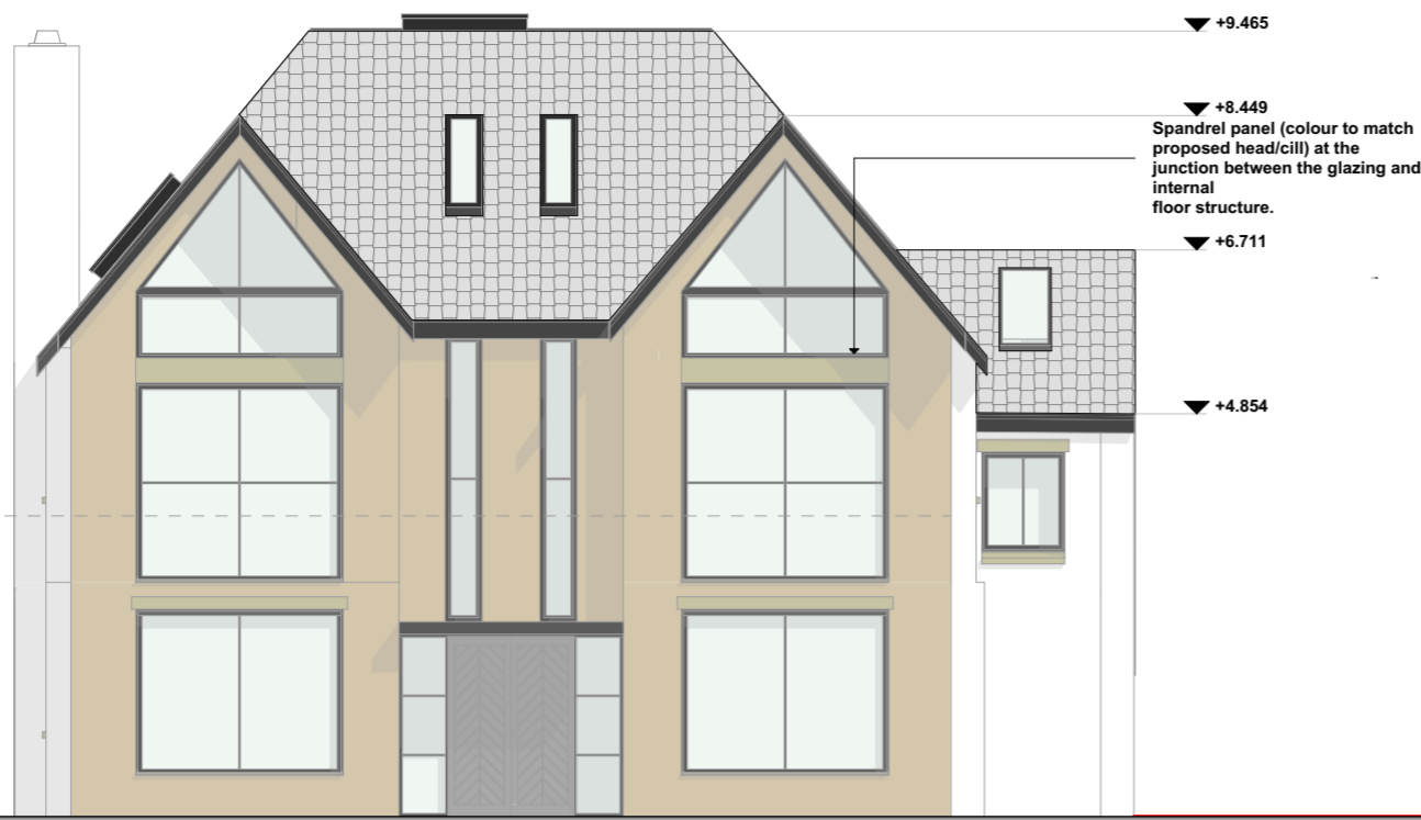
E1 West Elevation