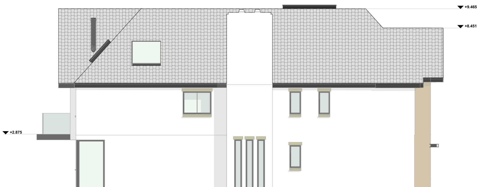
E4 North Elevation