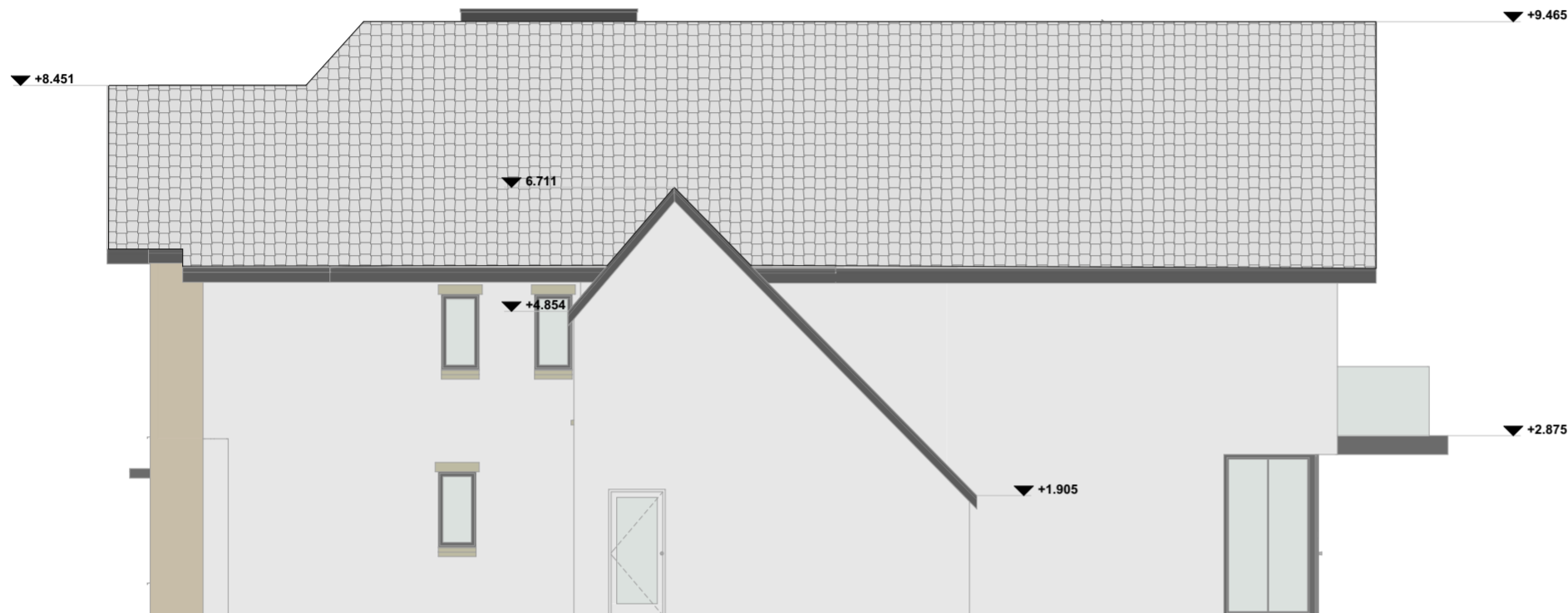
E2 South Elevation