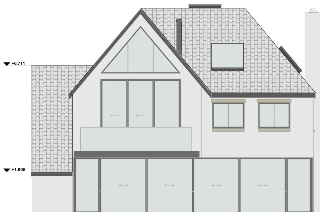
E3 East Elevation