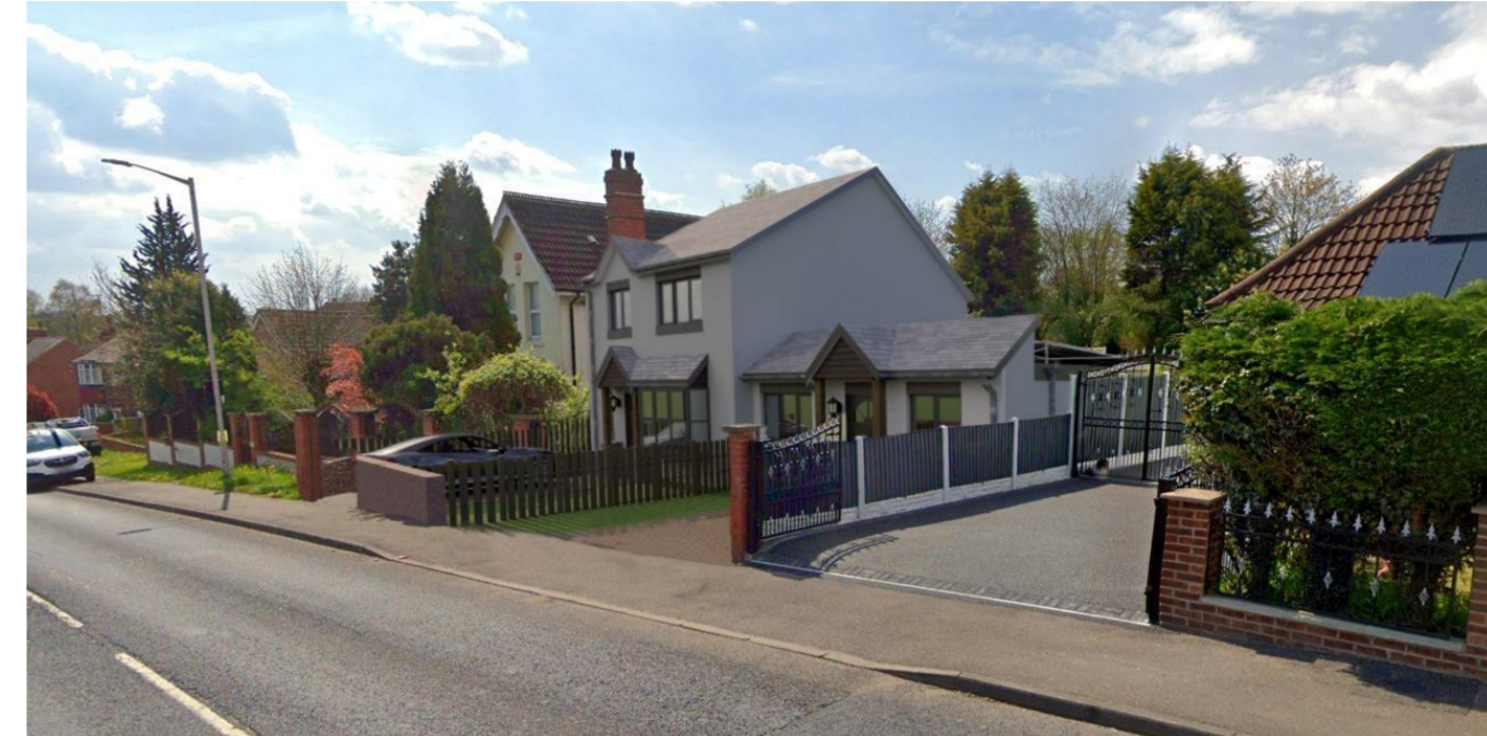
Street Insertion Perspective - As proposed