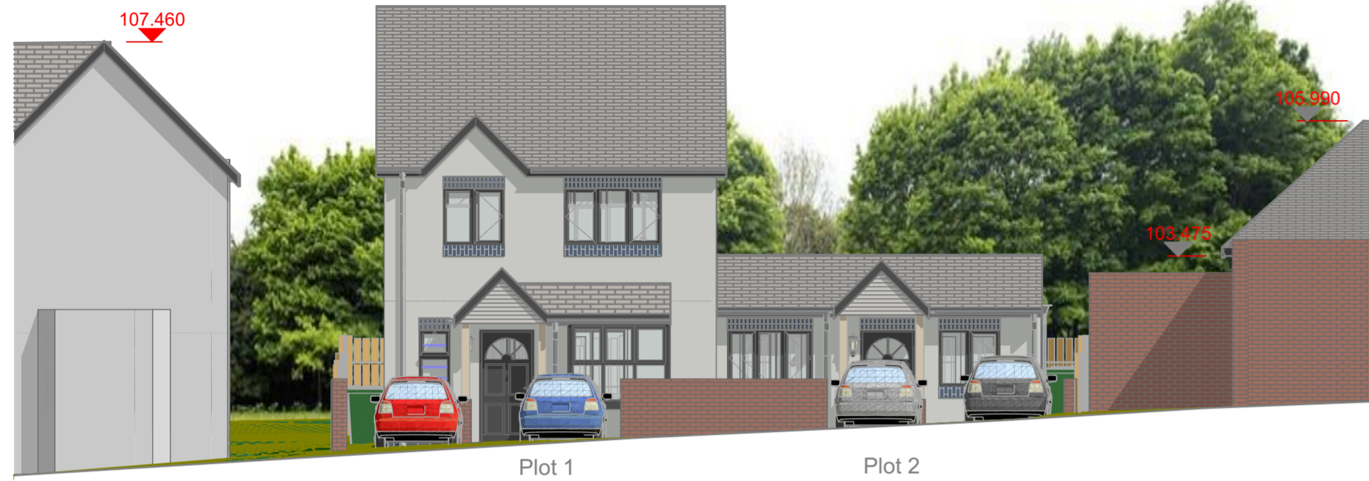
Proposed Street Scene