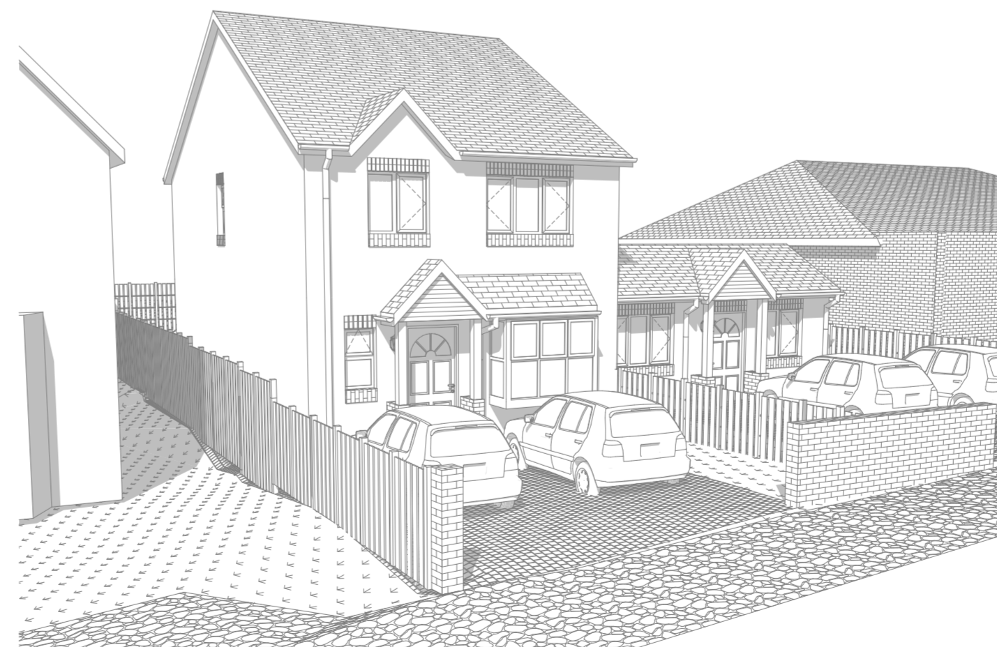
Front Sketch Perspective