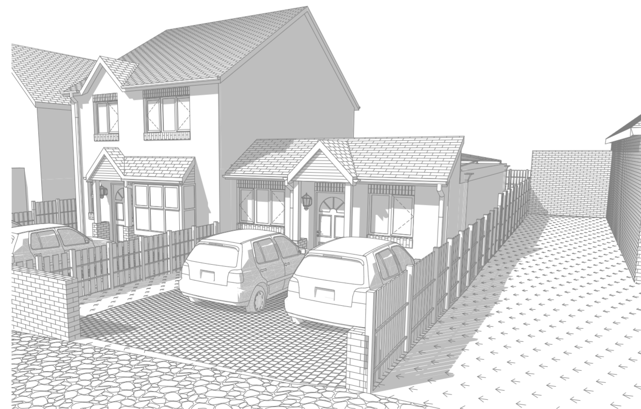
Front Sketch Perspective