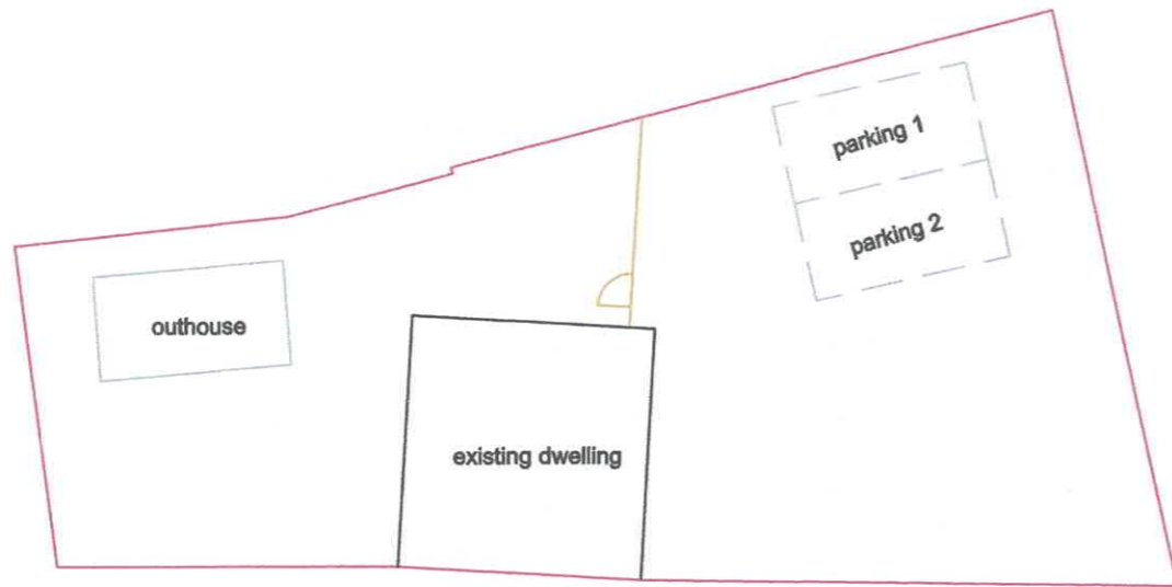
EXISTING BLOCK PLAN 1:200