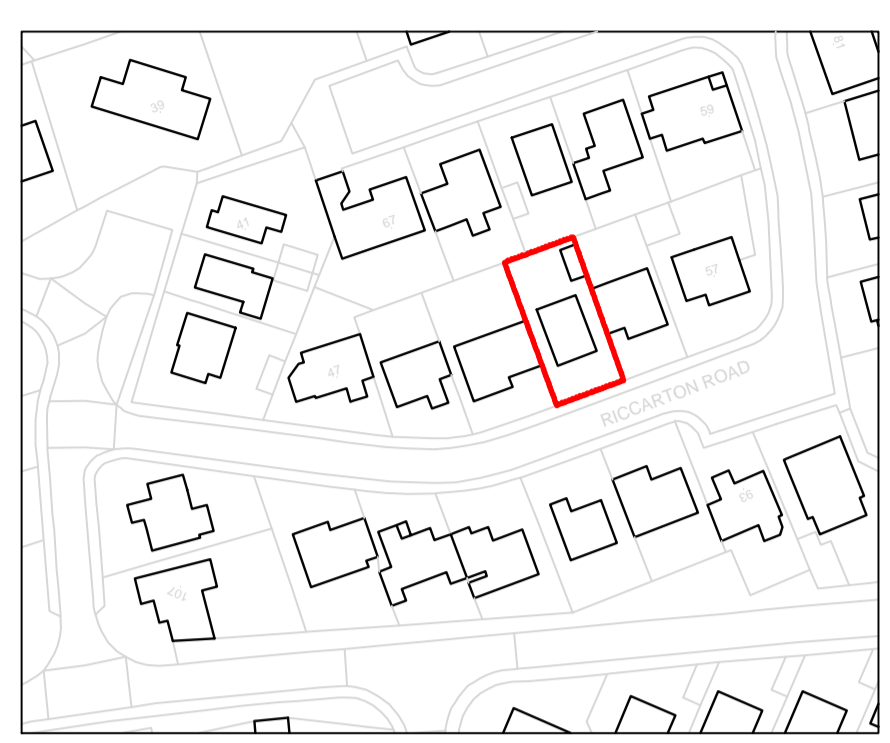
01 Location Plan 1:1250 @ A1