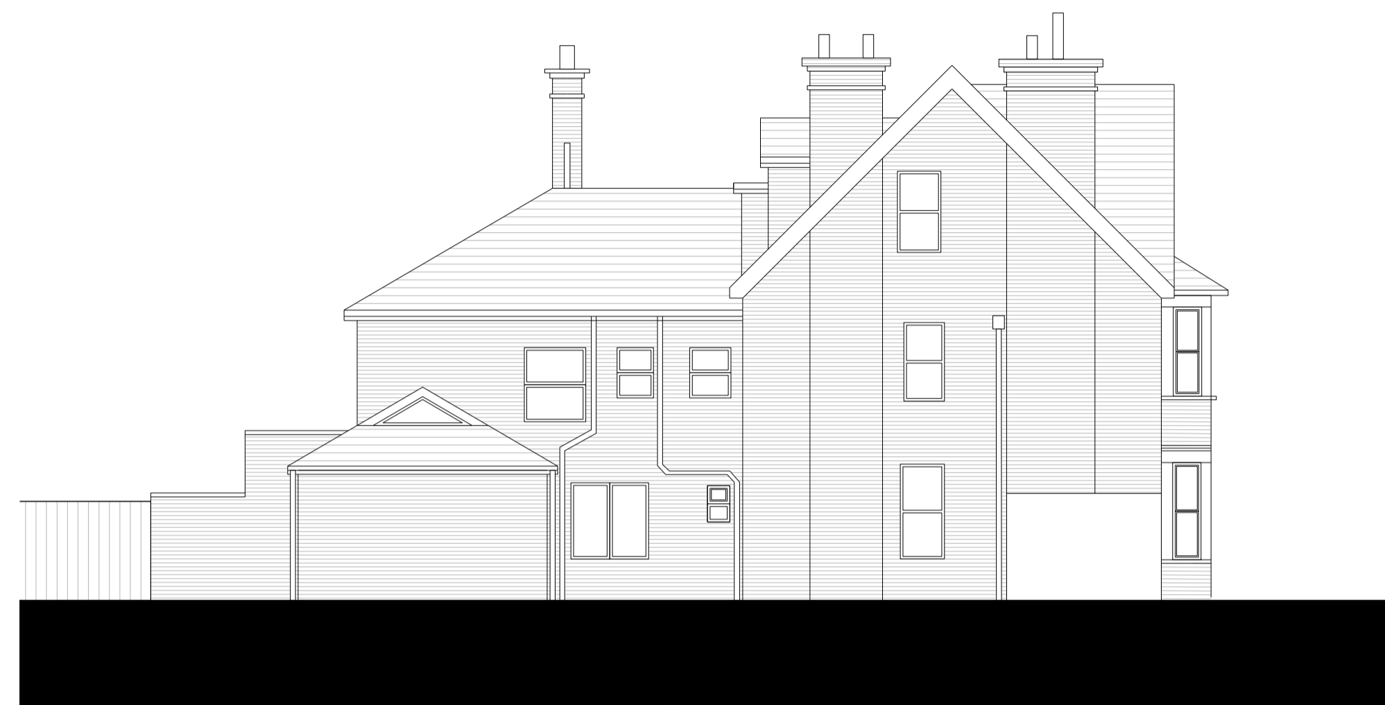
2 PLAN Existing Side Elevation SCALE 1: 100