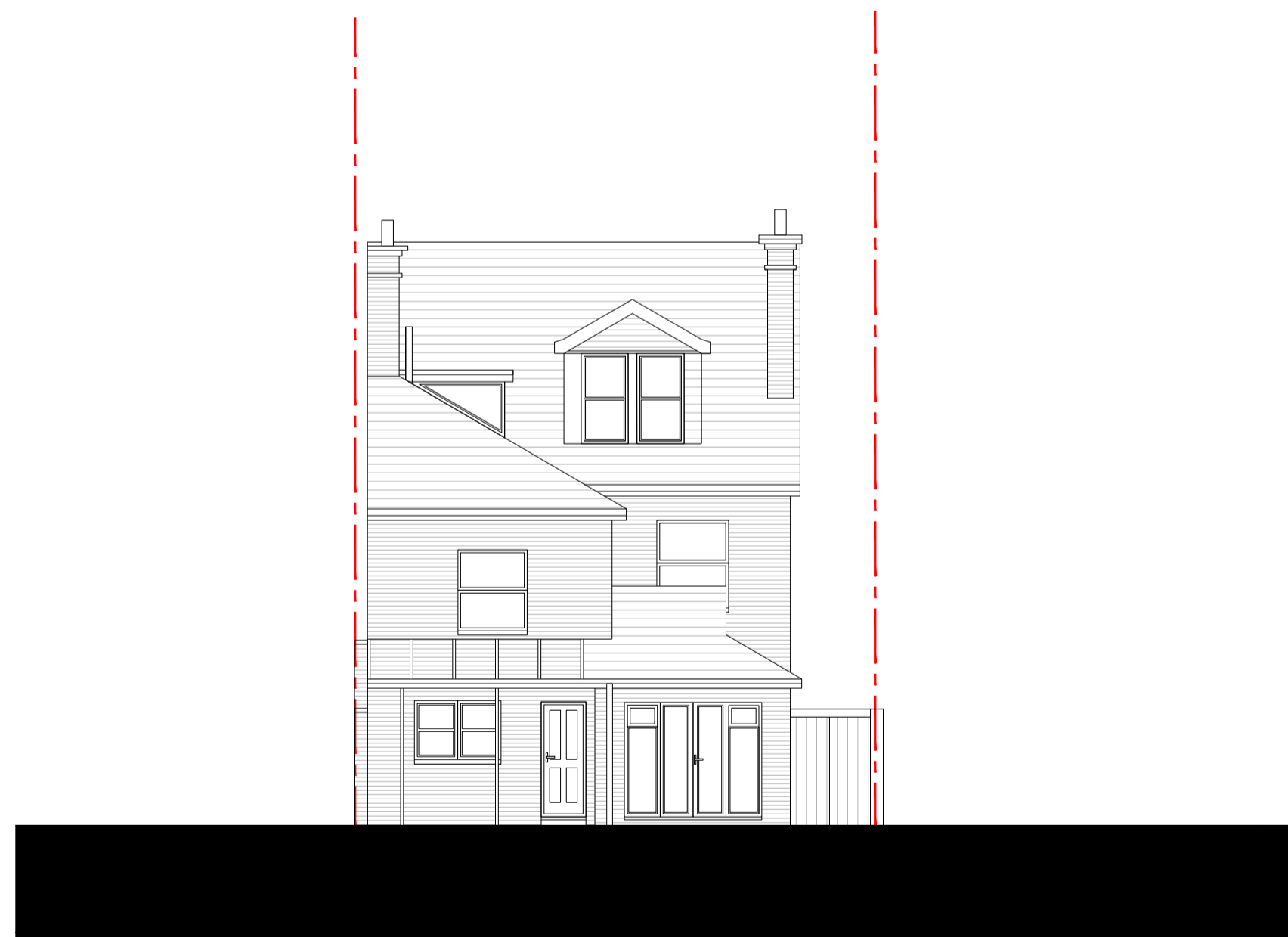
3 PLAN Existing Rear Elevation SCALE 1: 100