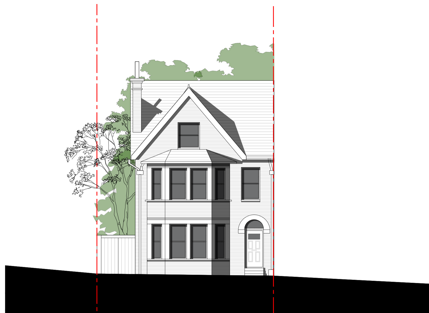
1 PLAN Proposed Front Elevation (Northeast) SCALE 1: 100

KEY Application Boundary (0.7 Ha) Outline of Existing Property