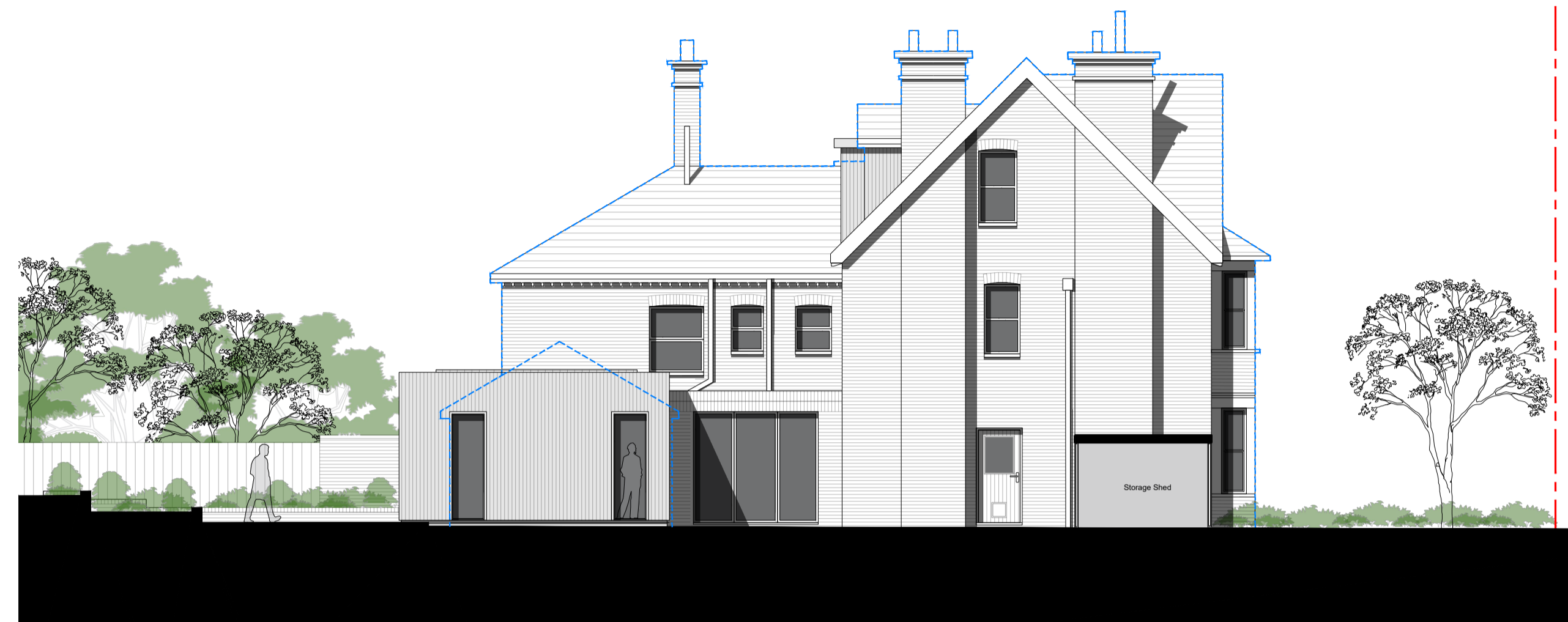
2 PLAN Proposed Side Elevation (Southeast) SCALE 1: 100