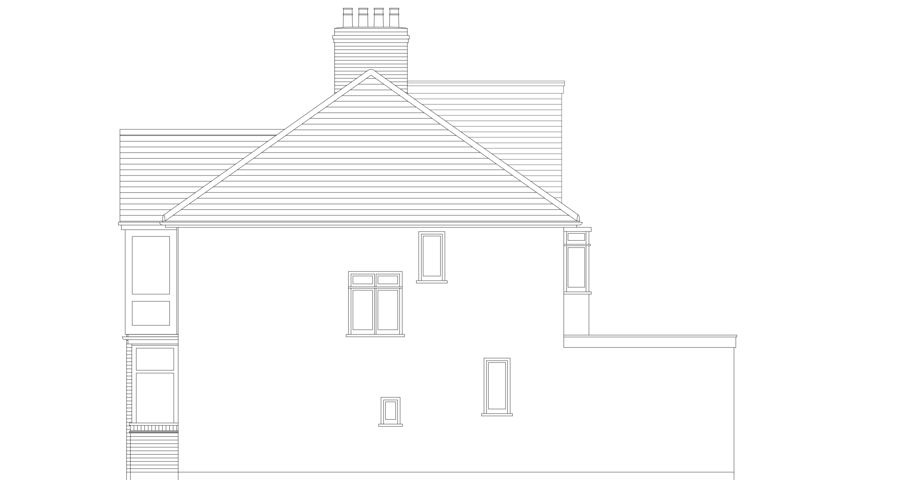
Existing Side Elevation (Scale 1:50)