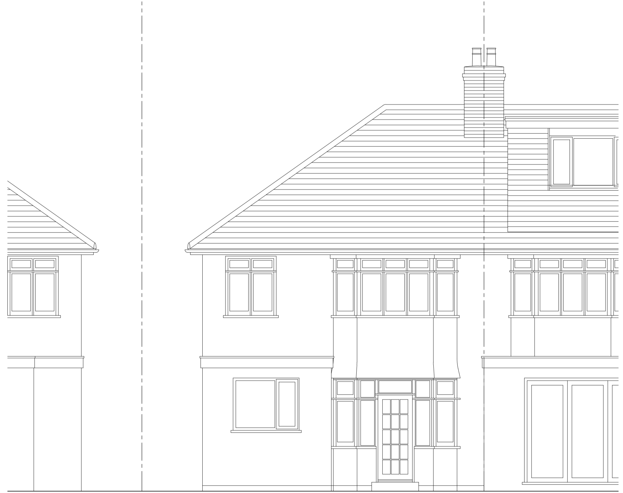
Existing Rear Elevation (Scale 1:50)