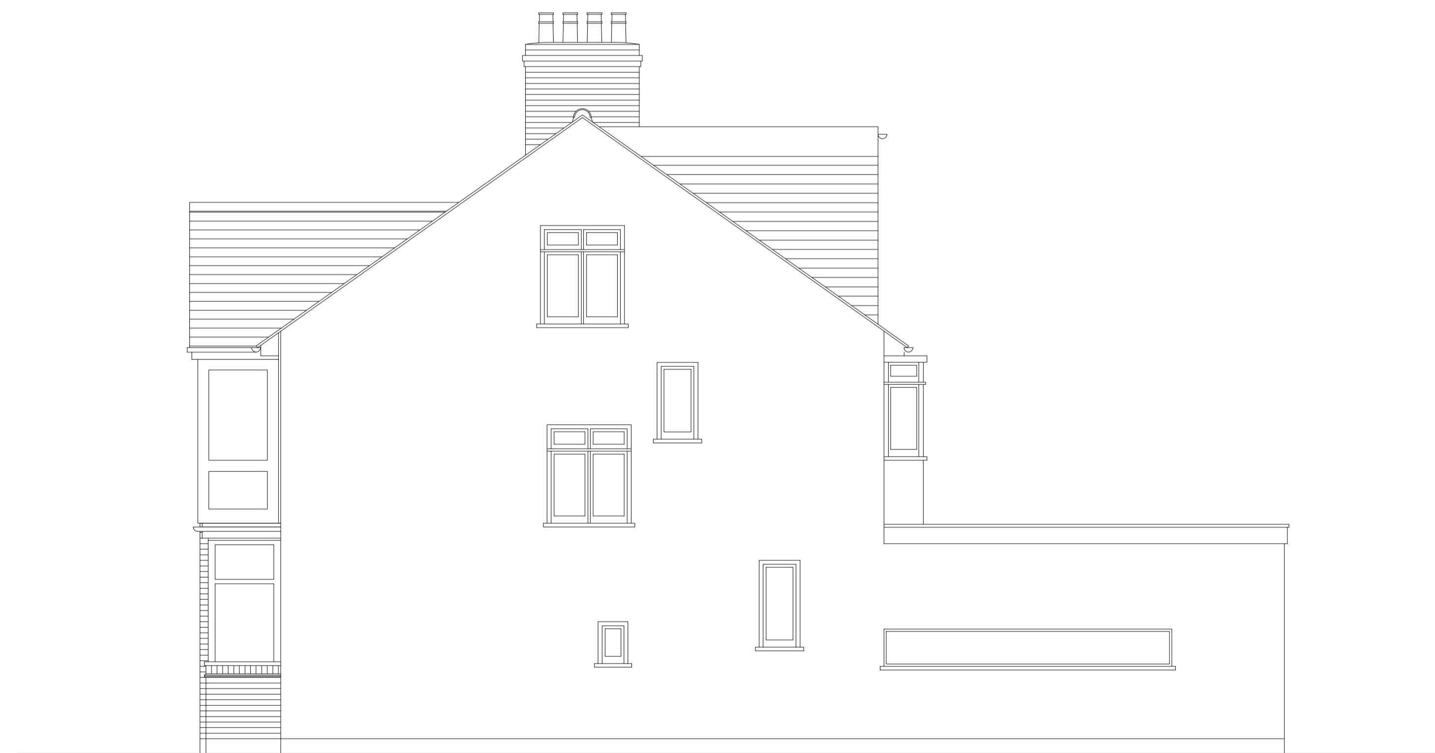
Proposed Side Elevation (Scale 1:50)