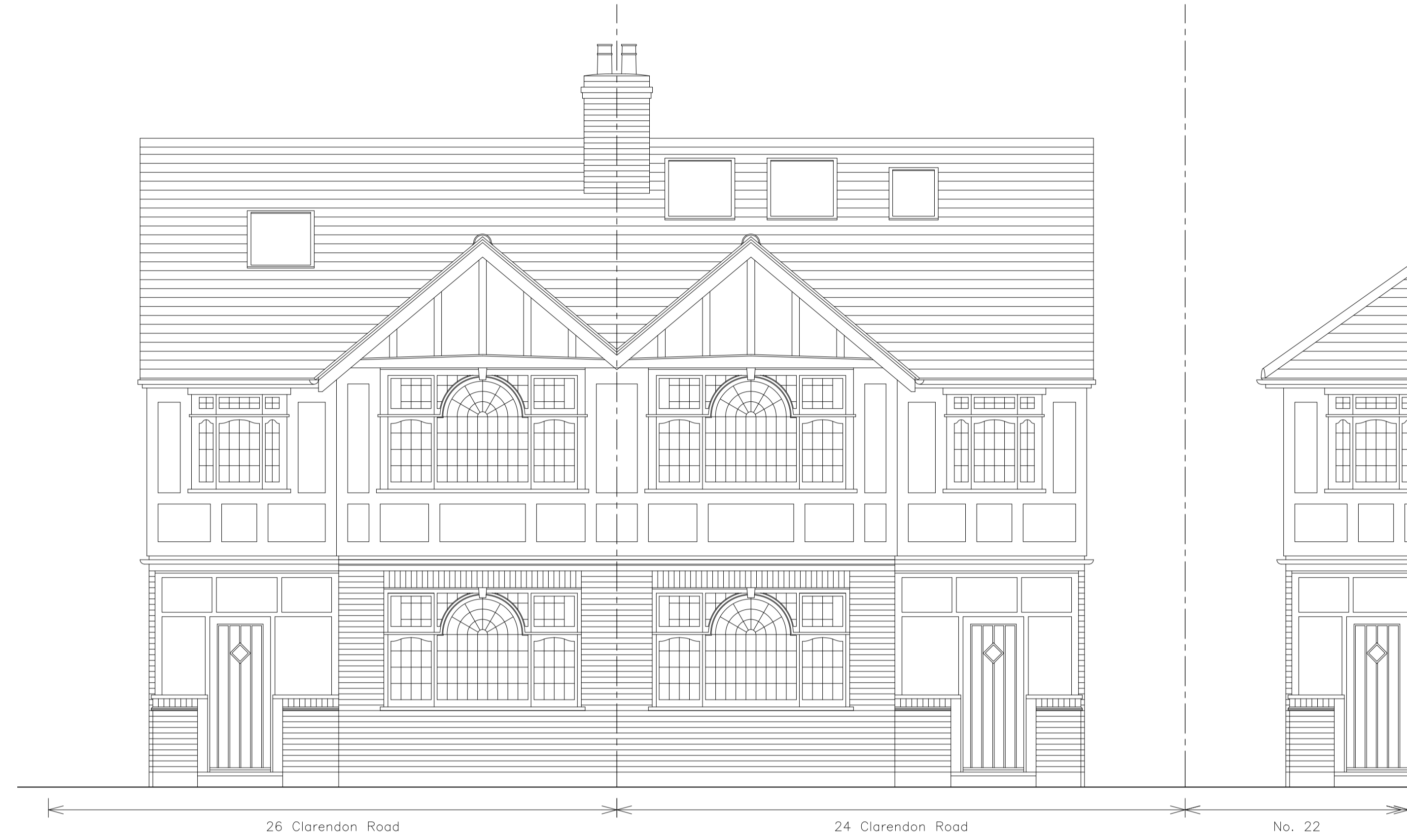
Proposed Front Elevation (Scale 1:50)