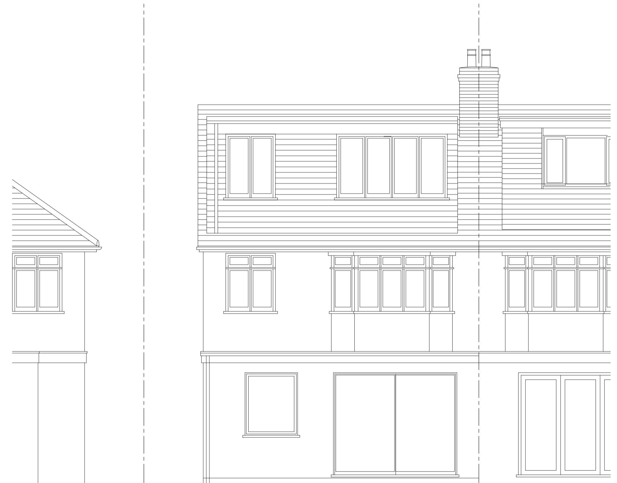
Proposed Rear Elevation (Scale 1:50)