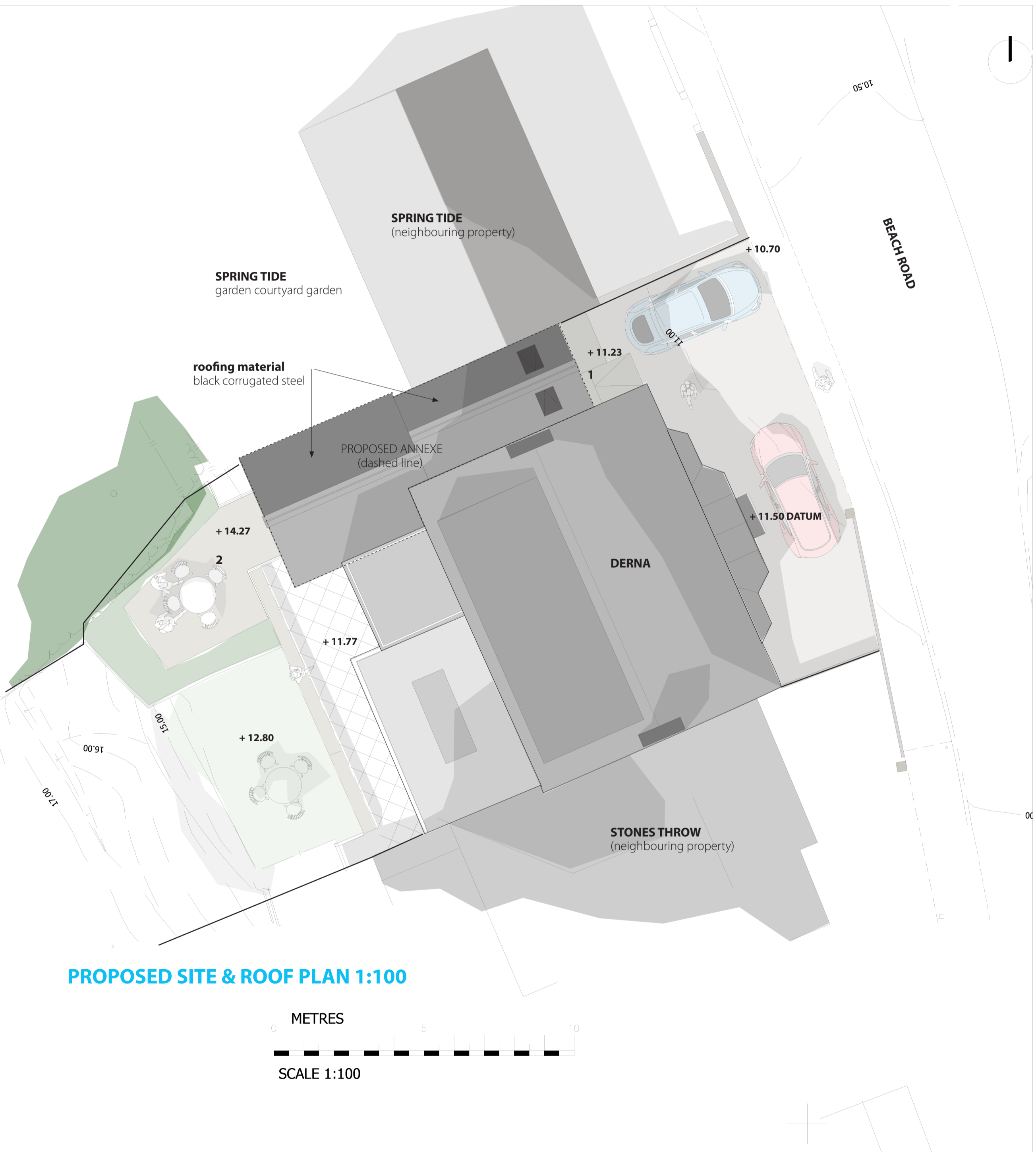
PROPOSED SITE & ROOF PLAN 1:100

NOTES This drawing is the copyright of Loop Design. It must not be copied or reproduced without written consent. Only figured dimensions are to be taken from this drawing. All contractors must visit the site and be responsible for taking and checking all dimensions related to the works shown on this drawing.