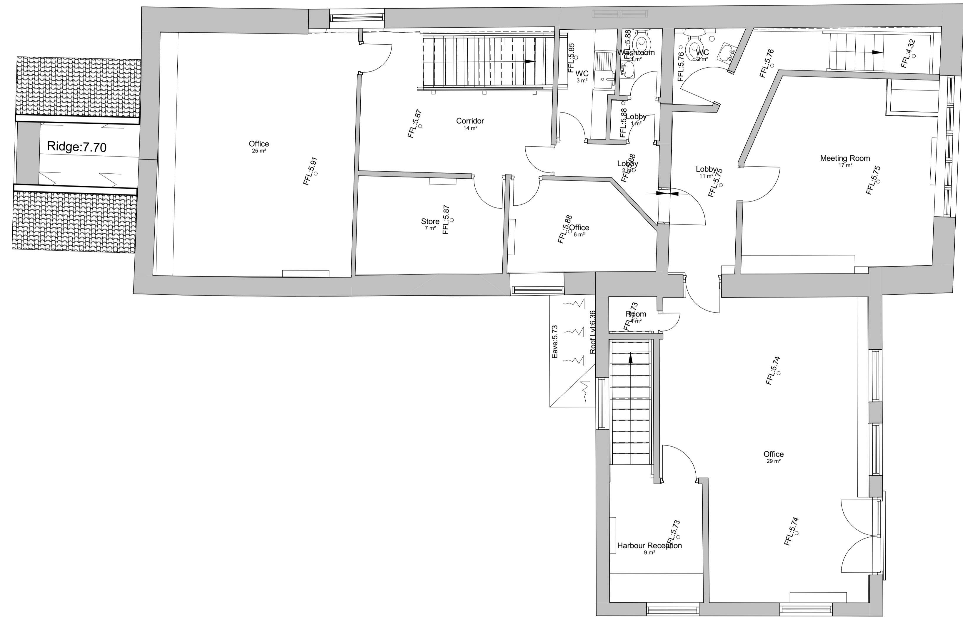
1 First Floor - Existing 1 : 50