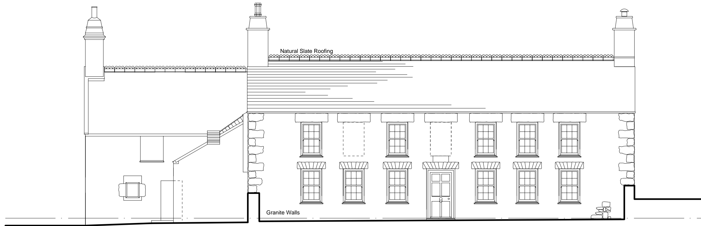
East Elevation Scale 1 : 100

General This Is Not A Working Drawing And Has Only Been Prepared To Obtain Local Authority & Building Permission Only. This Drawing Is To Be Read In Conjunction With The Structural Engineers Calculation Details. All Workmanship And Materials To Comply With The Current British Standards And Code's Of-practice. All Structural And Carcassing Timber To Be Stress Graded And Tanalised Treated. Contractor Must Check All Dimensions. Only Figured Dimensions Are To Be Worked From.