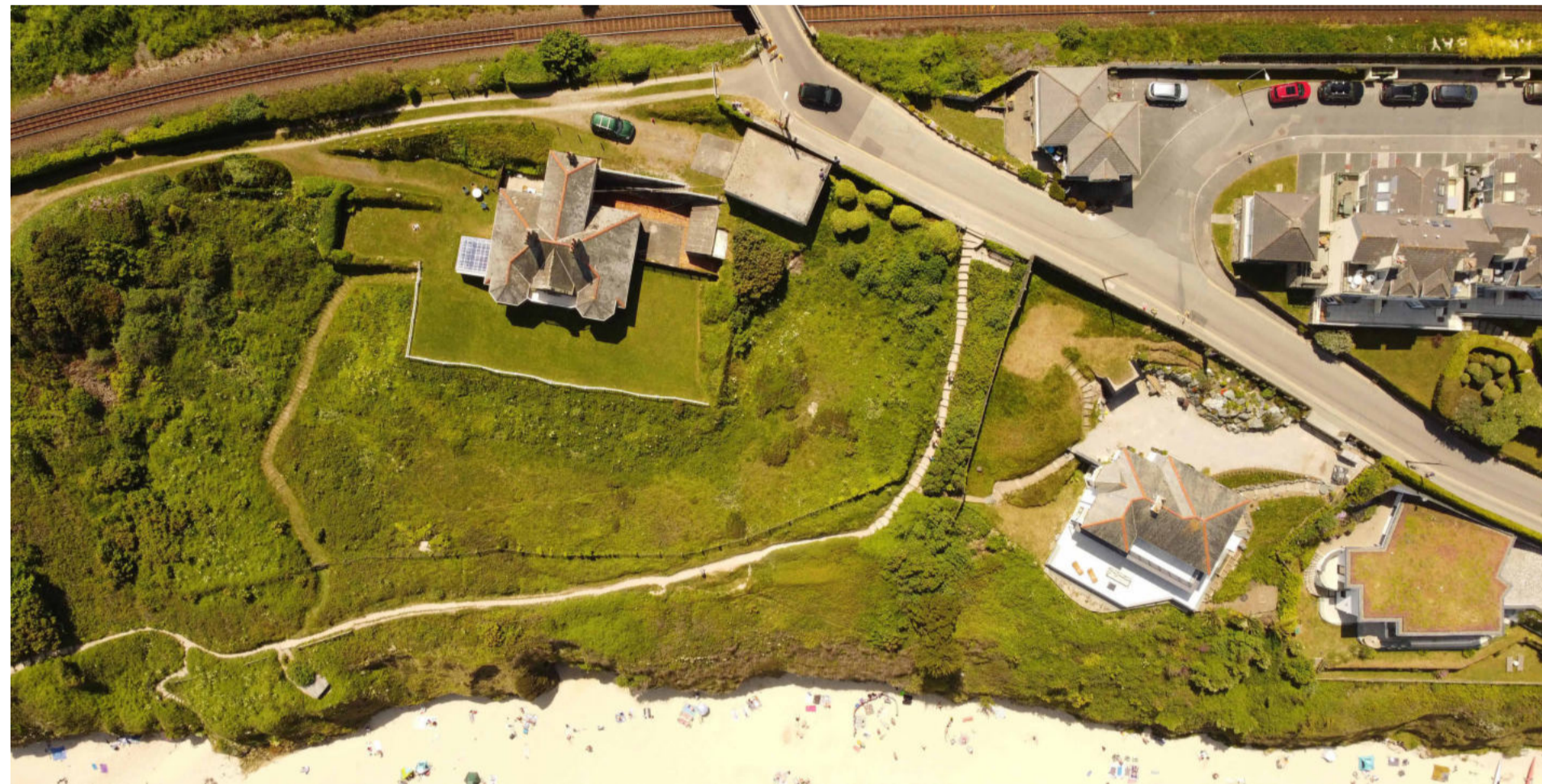
Birds eye view - Existing