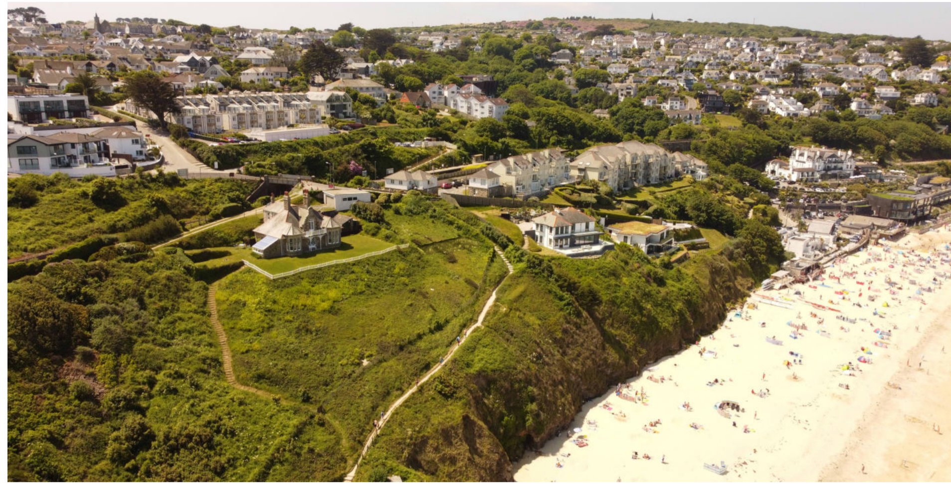
Arial view looking south west - Existing