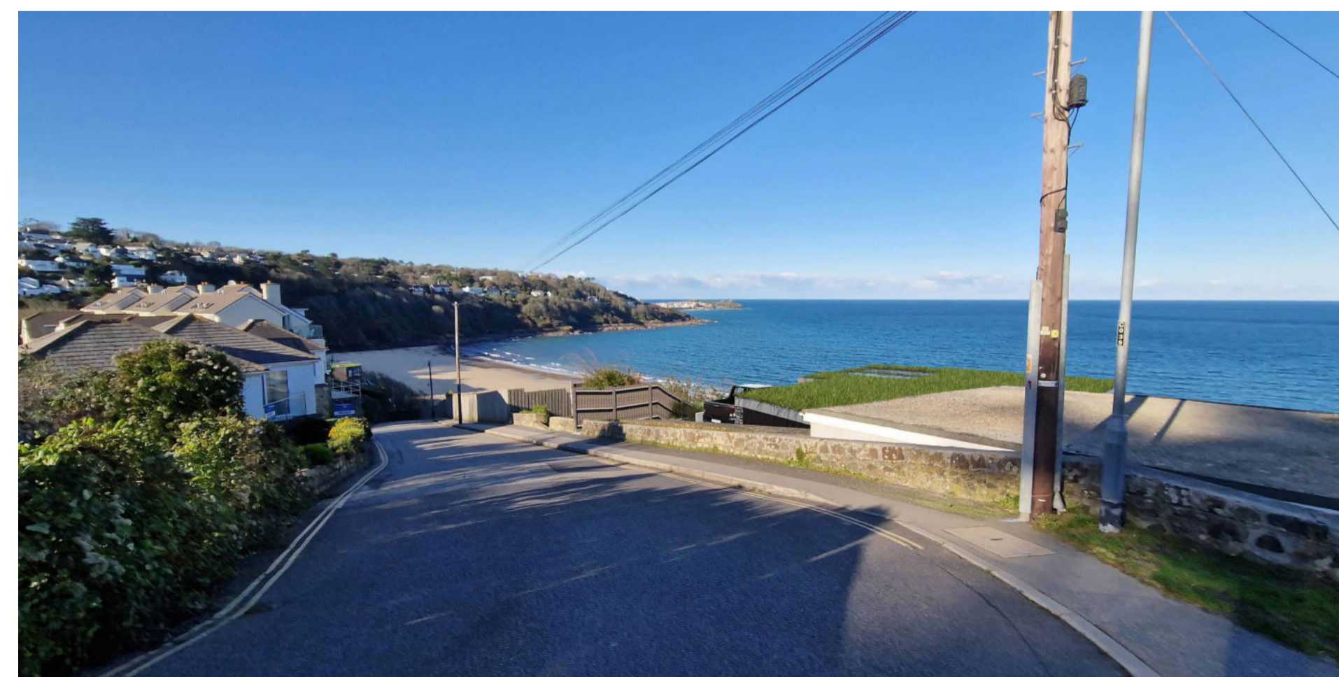
Roadside view from bridge on Beach Rd - Proposed