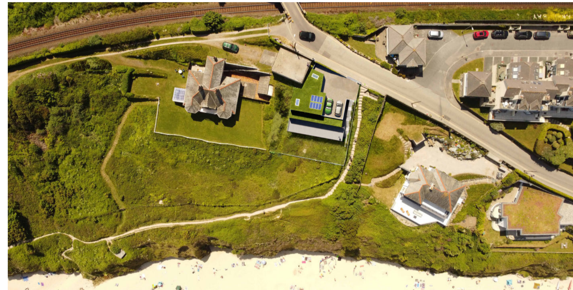
Birds eye view - Proposed