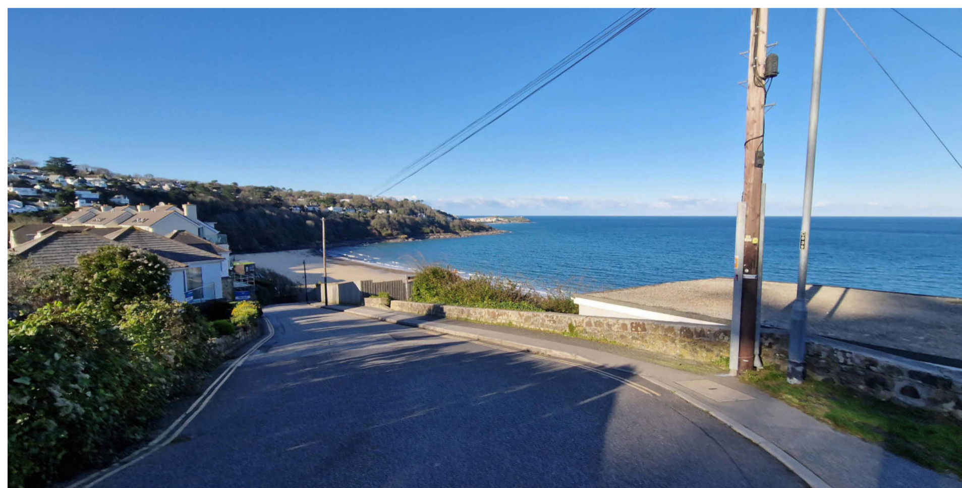
Roadside view from bridge on Beach Rd - Existing