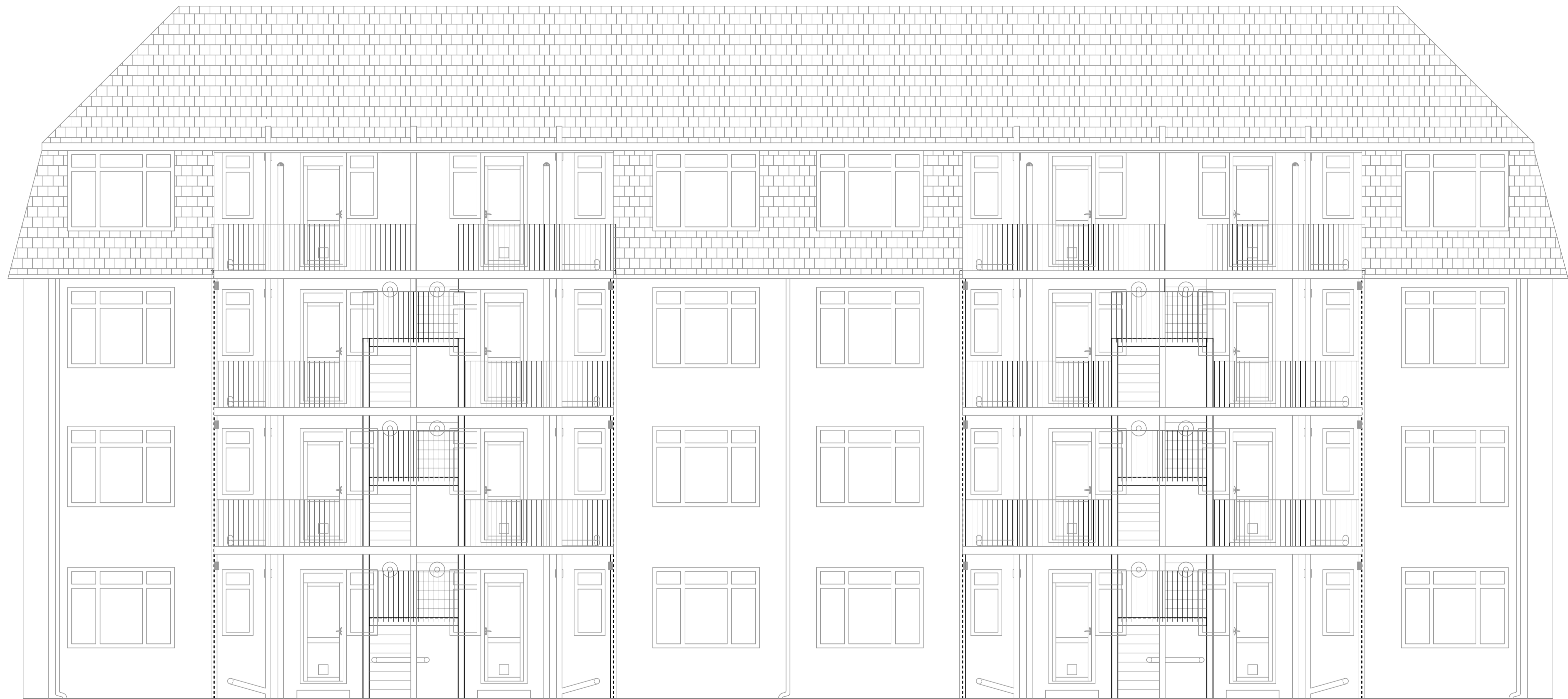
Existing Rear Elevation (Showing Face of Building) (1:50)