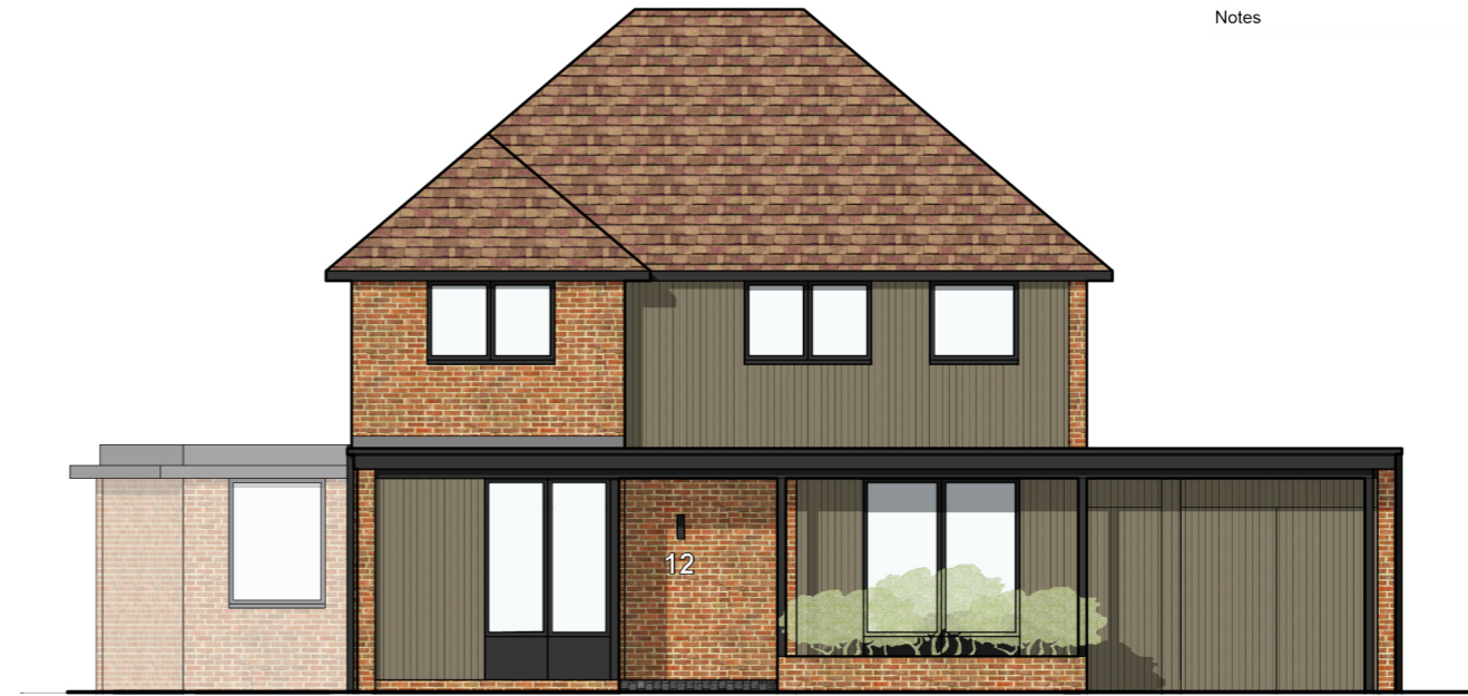
Proposed front (east) elevation