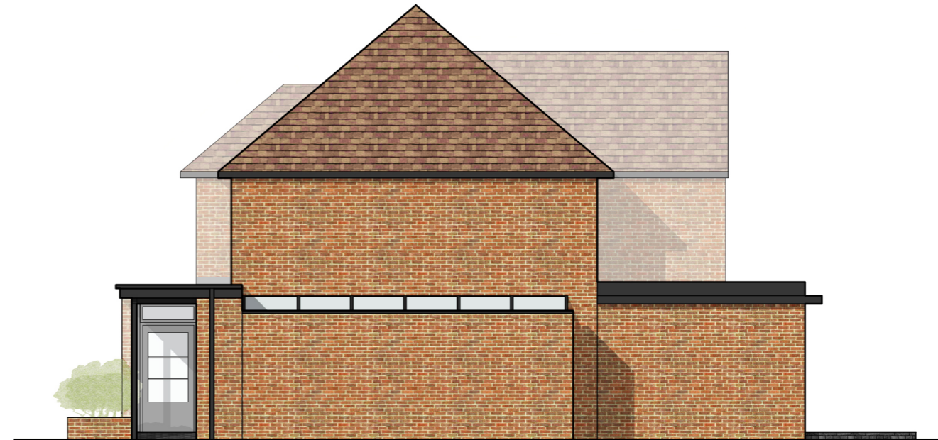
Proposed side (north) elevation