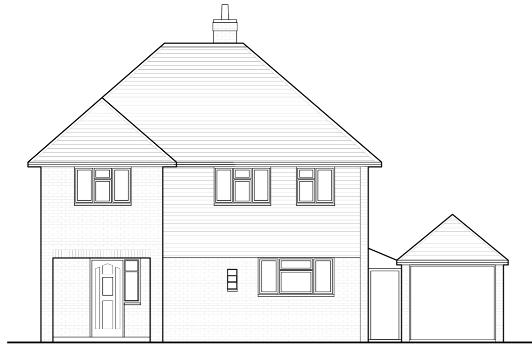
Existing front (east) elevation