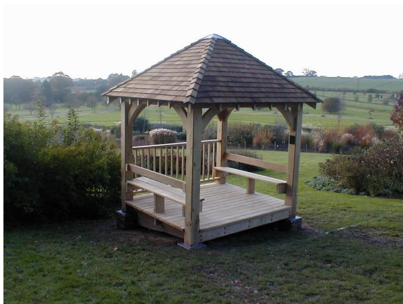
Fig.2. An example of the Oak-Framed Gazebo built by High Weald Furniture.

The Gazebo will be situated in the location that the derelict stables were positioned, adjacent to the access track (which is a public right of way). The structure will also serve to provide informal seating for passing walkers, with an information panel installed to inform visitors about the importance of breeding Swallows, and other nature found at the site.