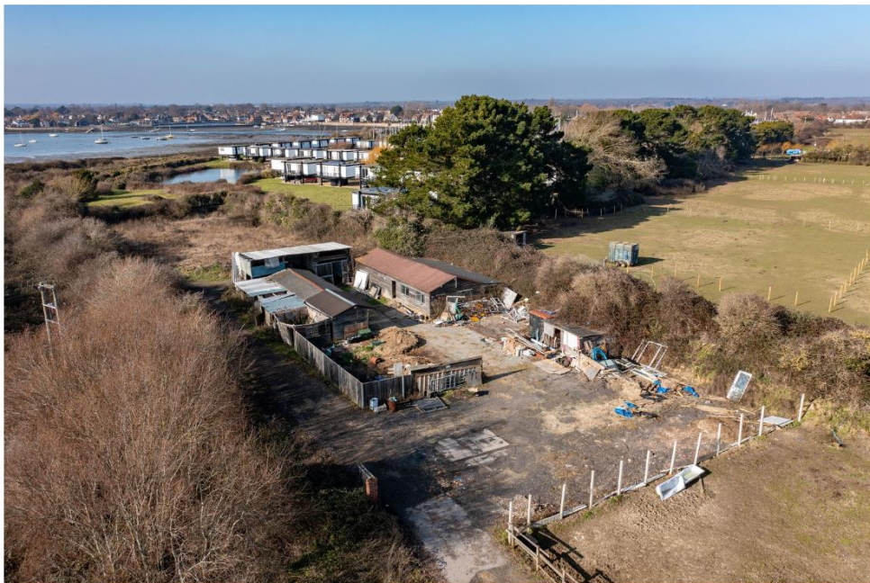
Fig 1. Marina Farm aerial view, January 2023

At that time, the property comprised 2.5 acres of land divided into three small paddocks with a large area of hard-standing, stables, storage sheds and a barn. There are two public rights of way through the property. The land adjoins the Chichester Harbour SSSI and SPA designated site. The Trust holds the 999-year lease of the adjacent property to the south, Eames Farm which is a local nature reserve and part of the Chichester Harbour SSSI/SPA.