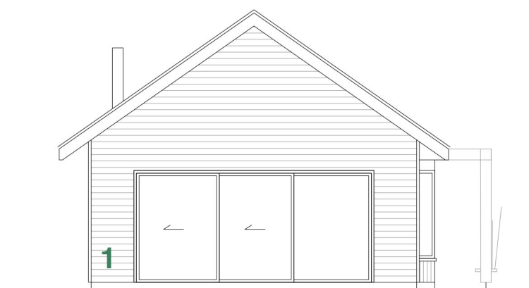
Proposed west elevation Scale 1:100@A3