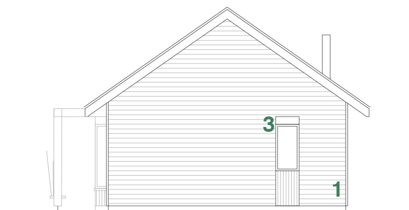
Proposed east elevation Scale 1:100@A3