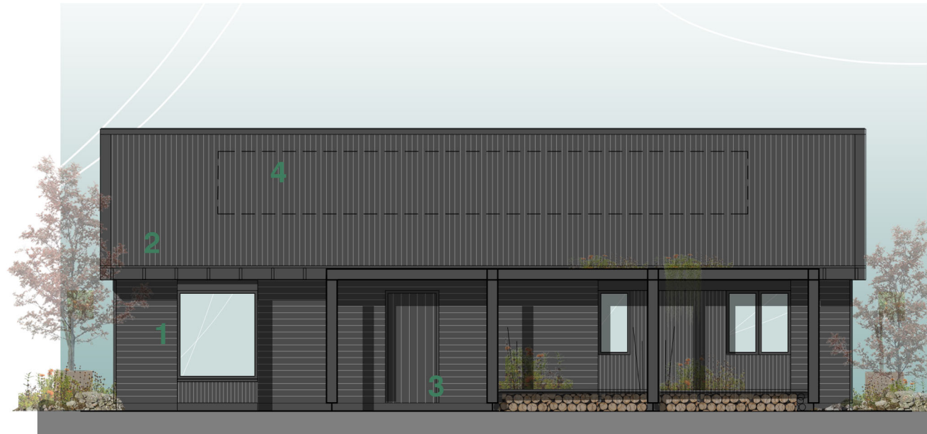
Proposed south elevation Scale 1:100@A3