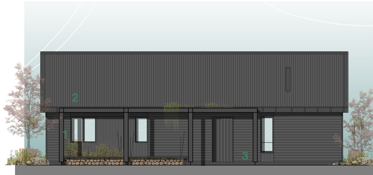
Proposed north elevation Scale 1:100@A3