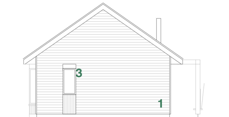
Proposed east elevation Scale 1:100@A3