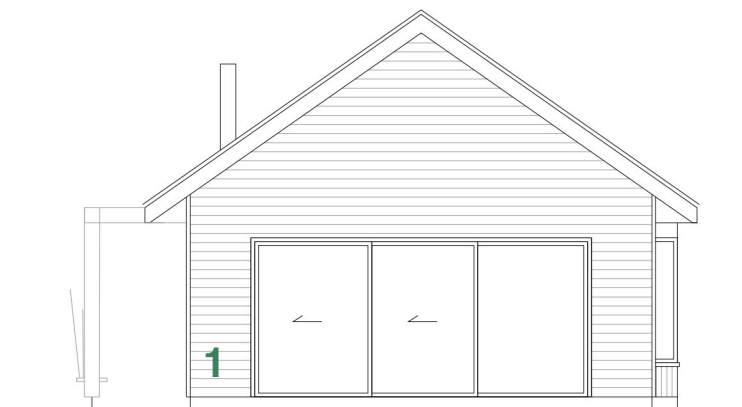
Proposed west elevation Scale 1:100@A3