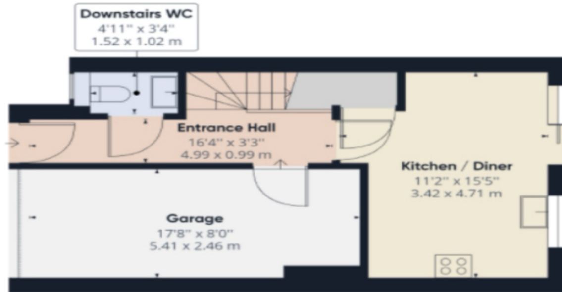
Existing Floor plan