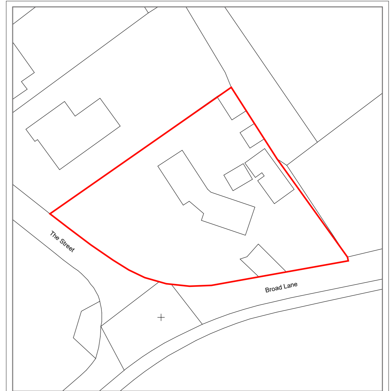
Existing Block Plan (1:500)