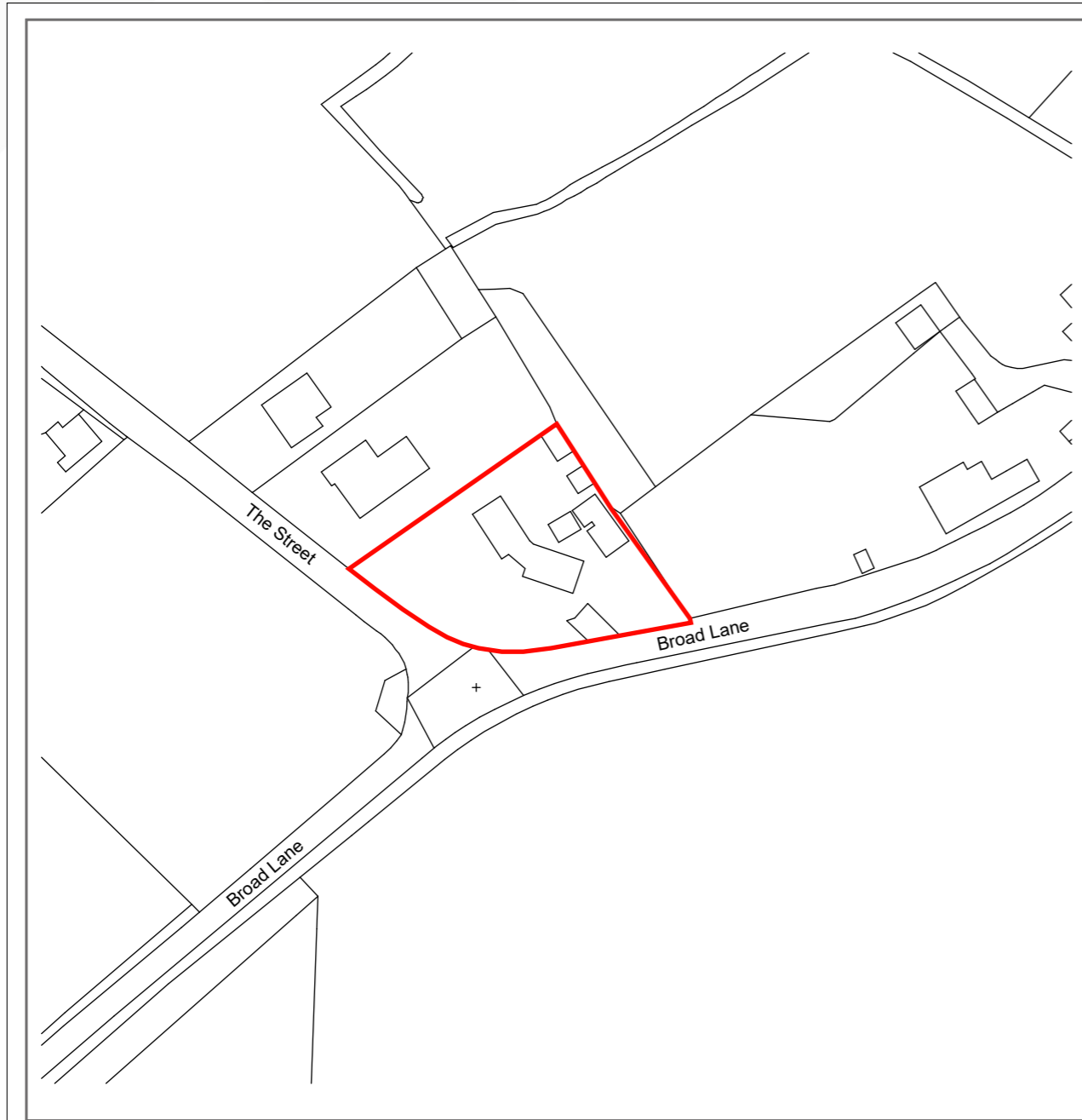
Existing Location Plan (1:1250)