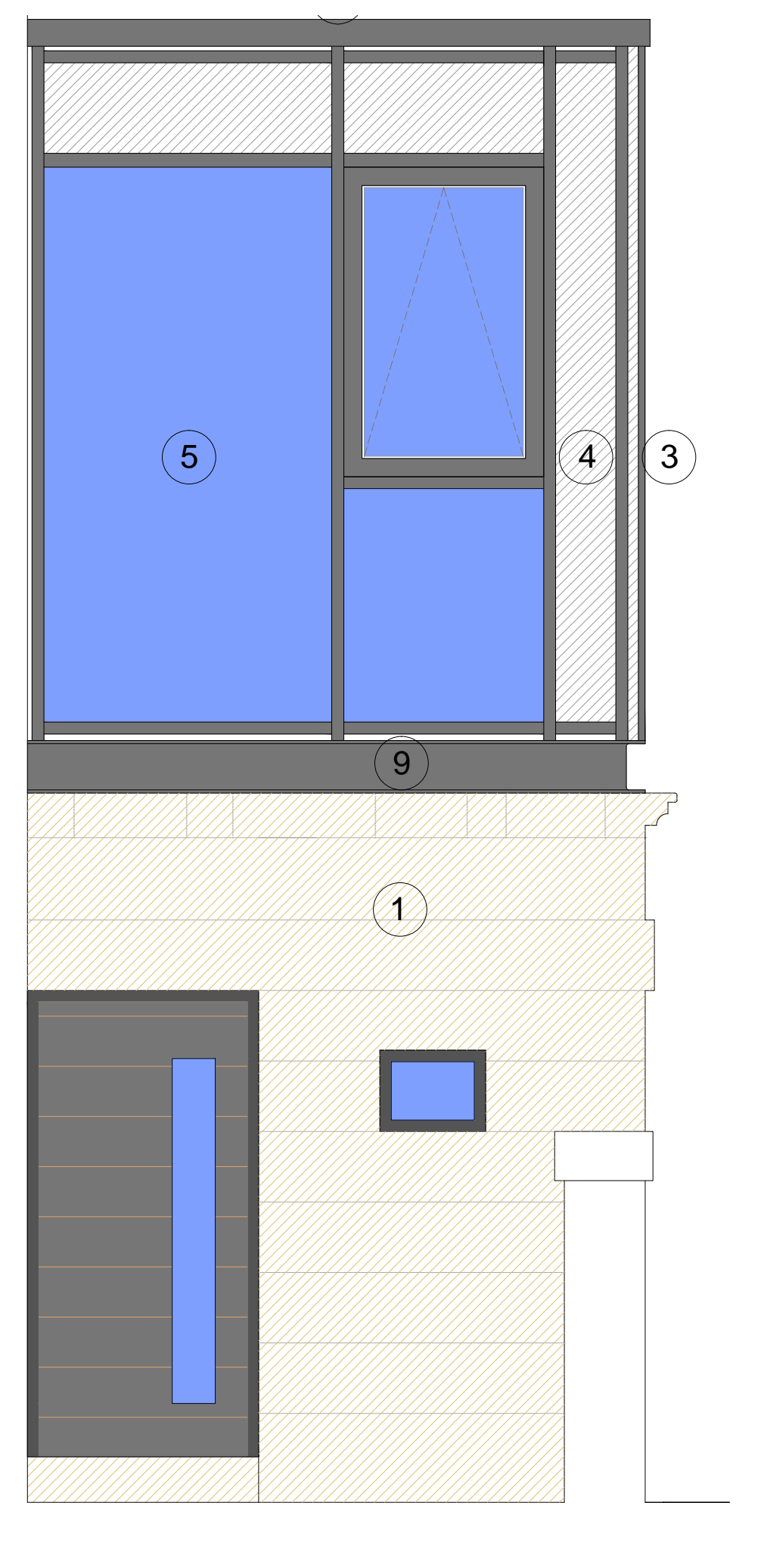
North West Elevation as Proposed - 1:25