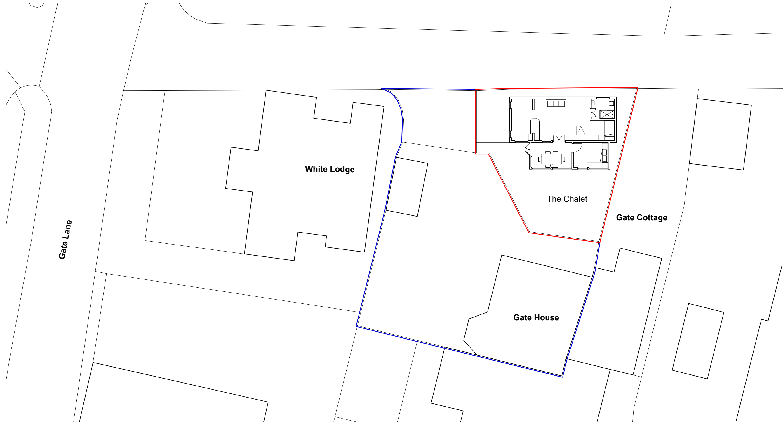
Existing Site Plan