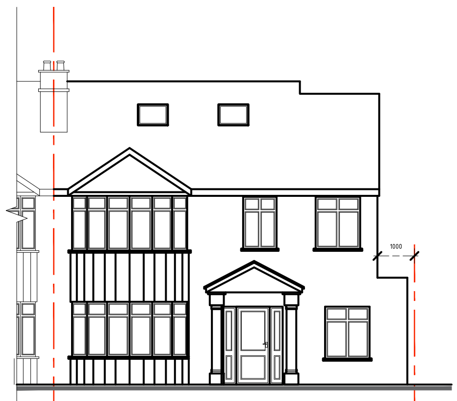
PROPOSED FRONT ELEVATION 1:100@A3