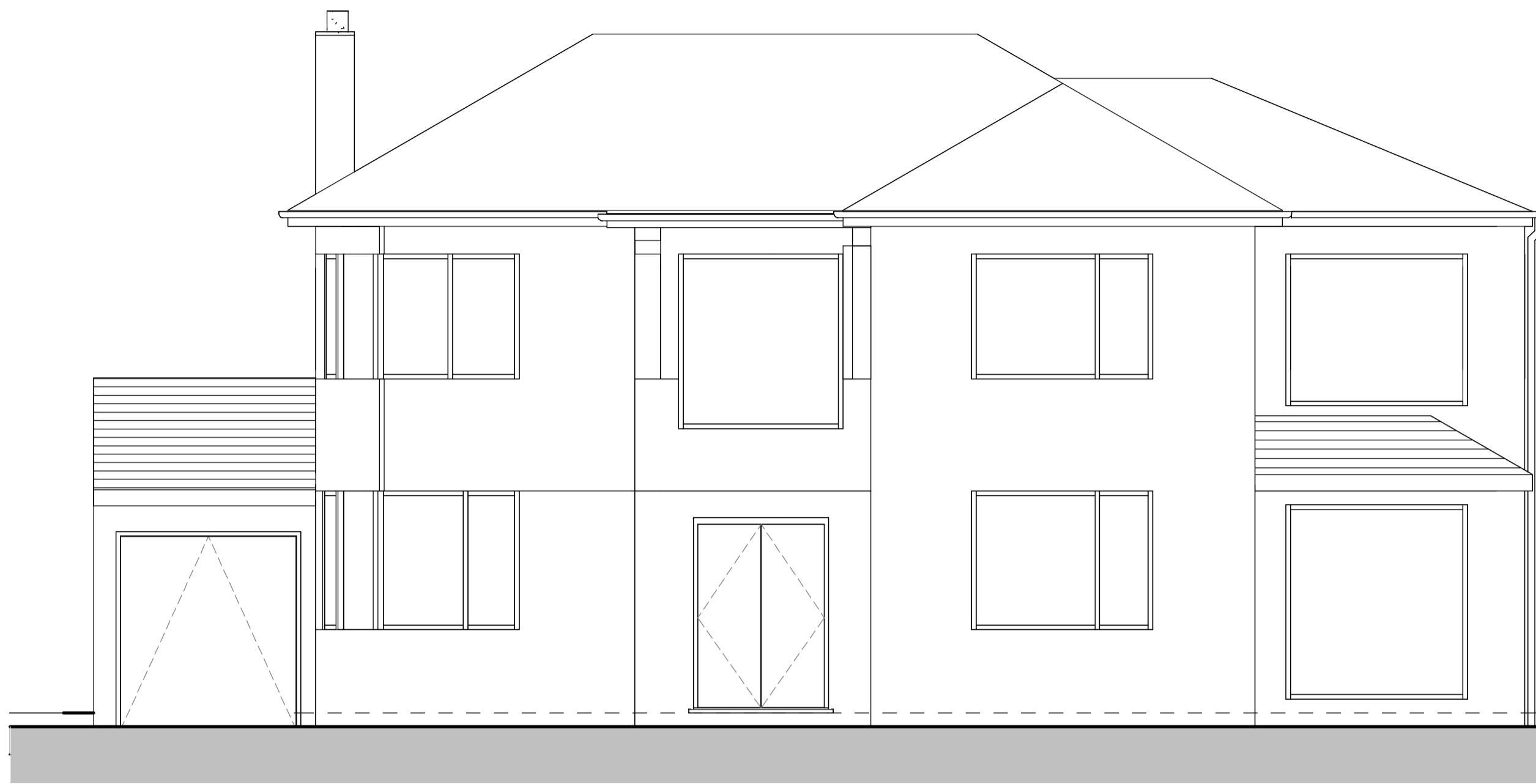
3 South West Proposed 1 : 50

DO NOT SCALE DIMENSIONS FROM THIS DRAWING