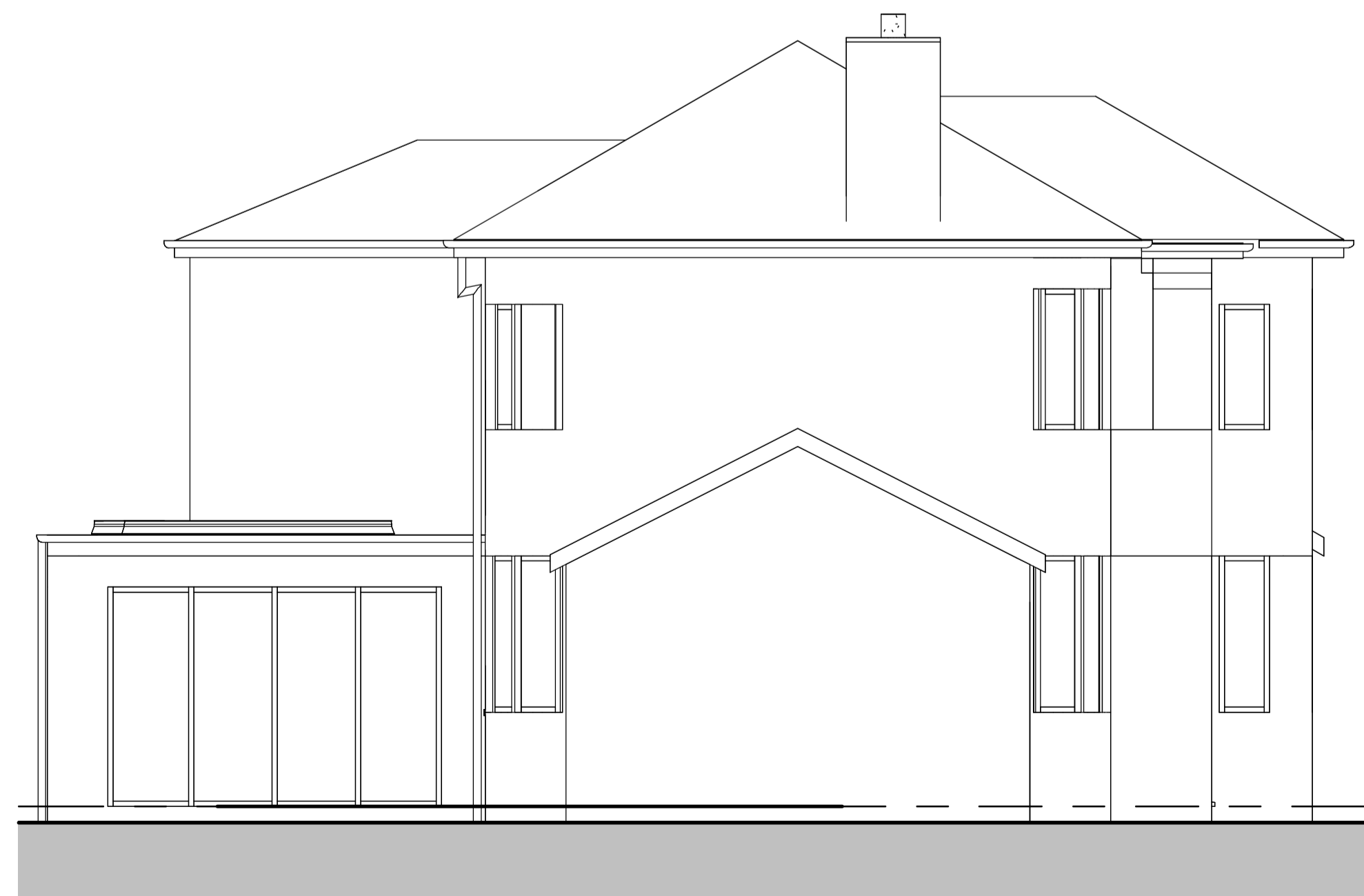
2 Side Existing 1 : 50