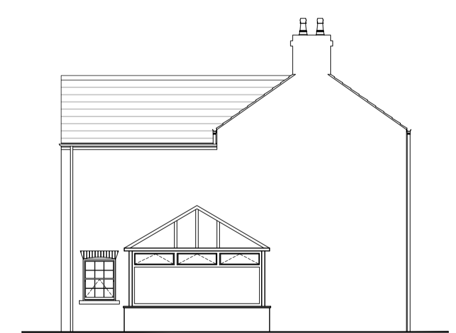
EXISTING SIDE ELEVATION Scale - 1:100 @ A1