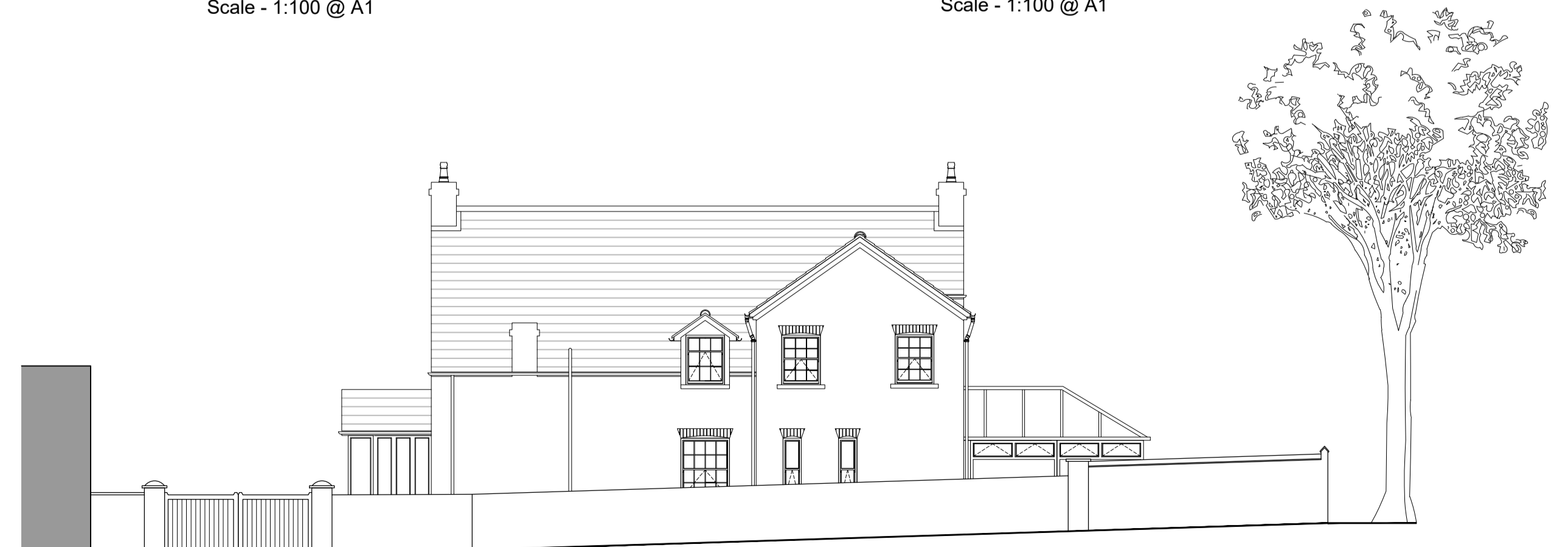
EXISTING STREET SCENE ELEVATION Scale - 1:100 @ A1

revisions S1 Issued for planning. 08.11.2023 TC