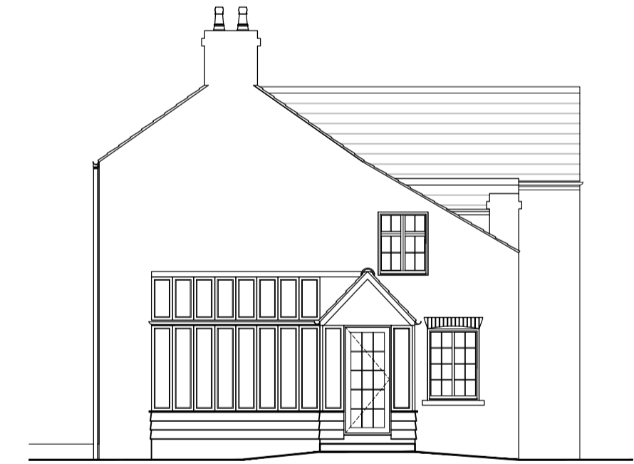
EXISTING SIDE ELEVATION Scale - 1:100 @ A1