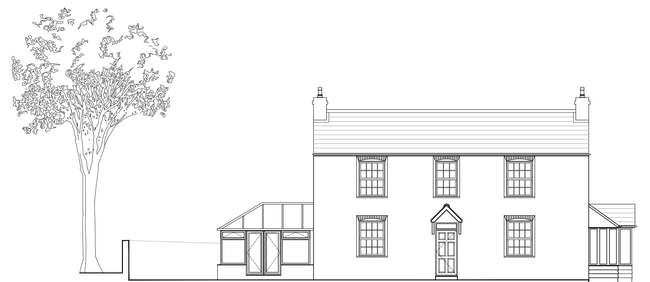
EXISTING REAR ELEVATION Scale - 1:100 @ A1