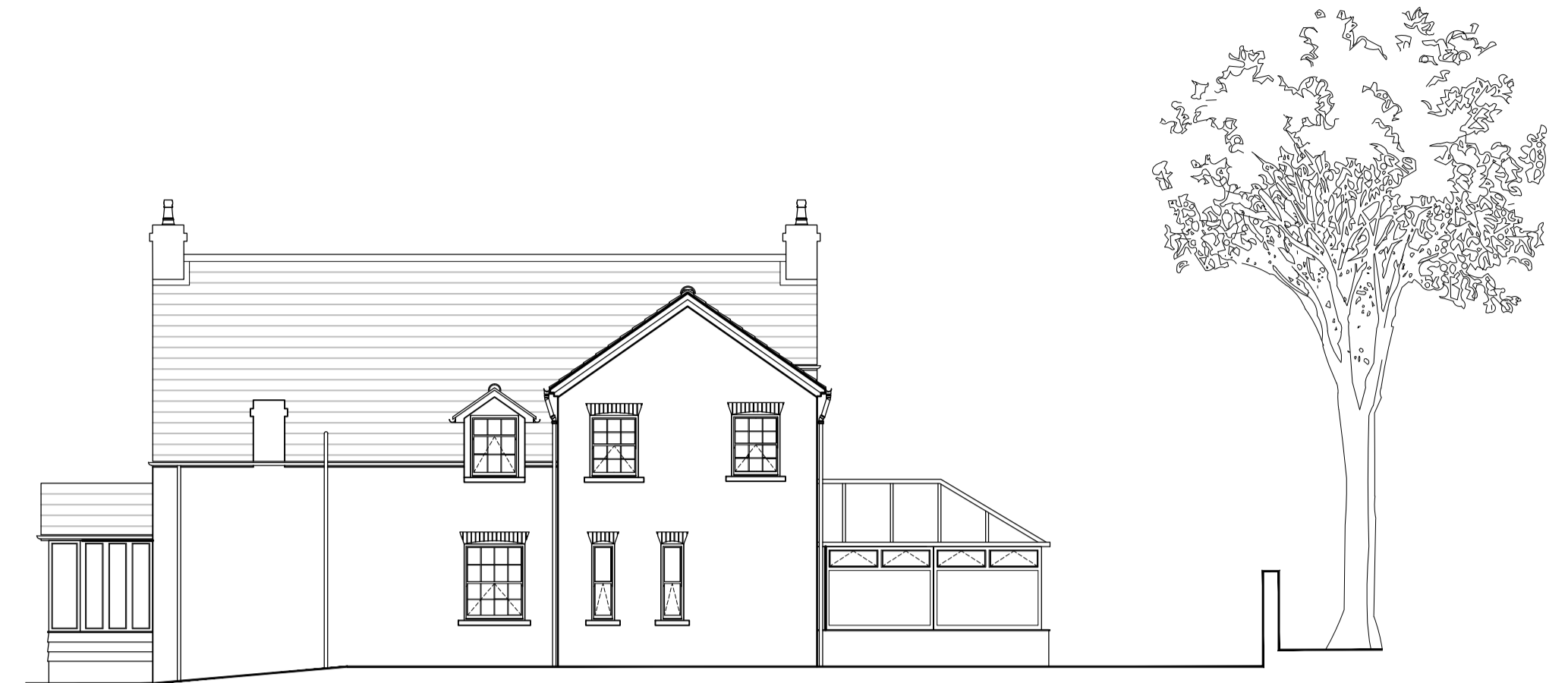
EXISTING FRONT ELEVATION Scale - 1:100 @ A1