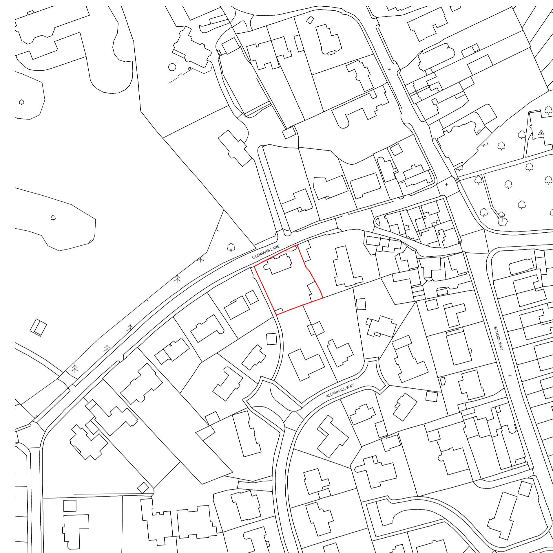
LOCATION PLAN Scale - 1:1250 @ A1 Licence ref - 100057546