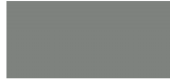
Dulux Heritage Waxed Khaki