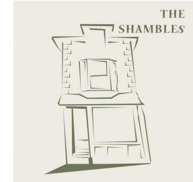
Hand Painted Signs