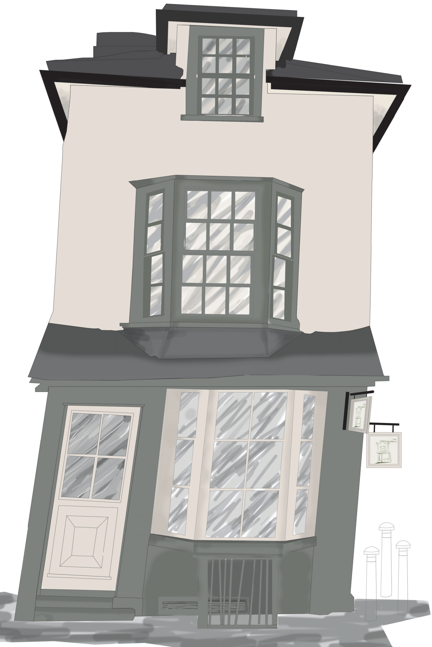
1 Proposed Front External Elevation Scale: 1:20