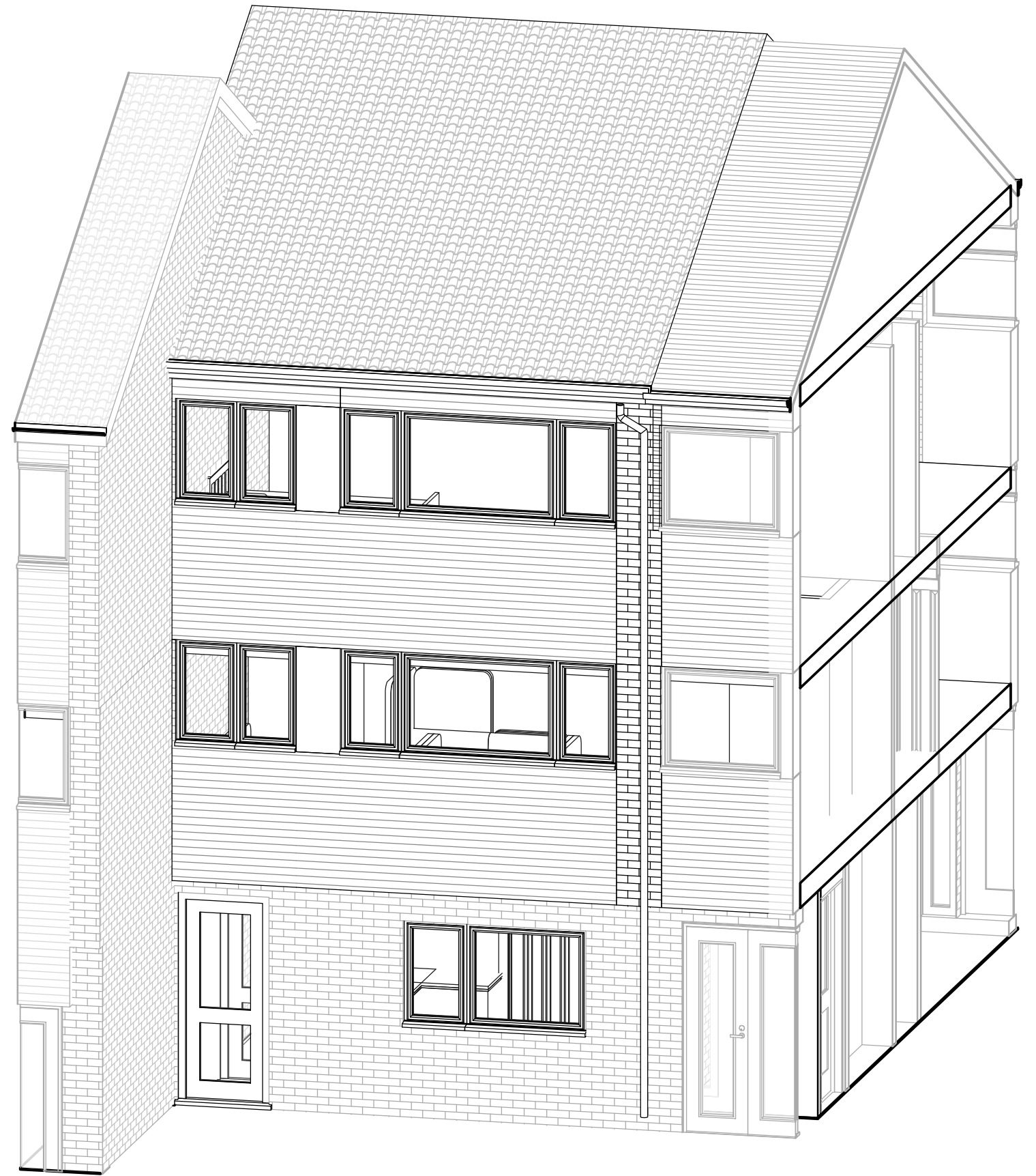
Proposed 3D view