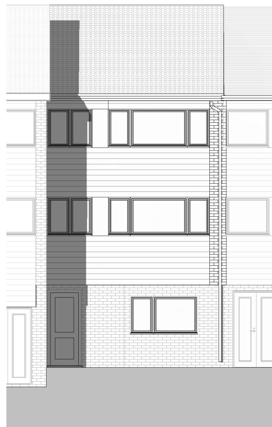
Proposed Front Elevation 1:100