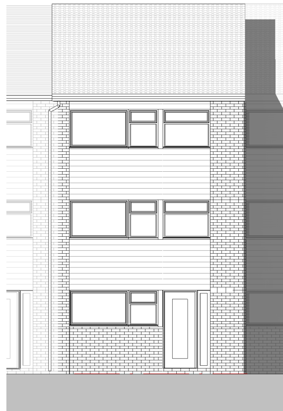
Rear Elevation 1:100