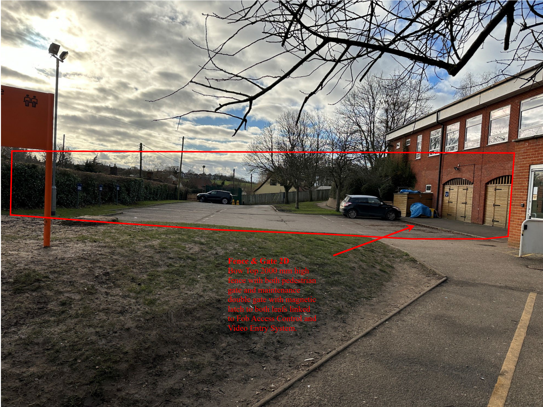
Fence & Gate 2D Bow Top 2000 mm high fence with both pedestrian gate and maintenance double gate with magnetic latch to both leafs linked to Fob Access Control and Video Entry System.