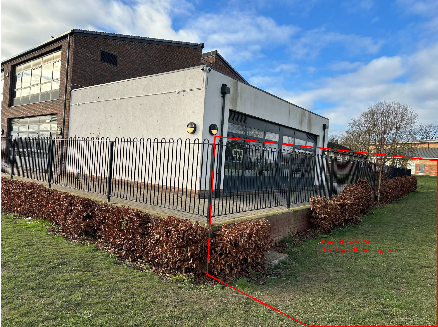
Fence & Gate 2A Bow Top 2000 mm high fence