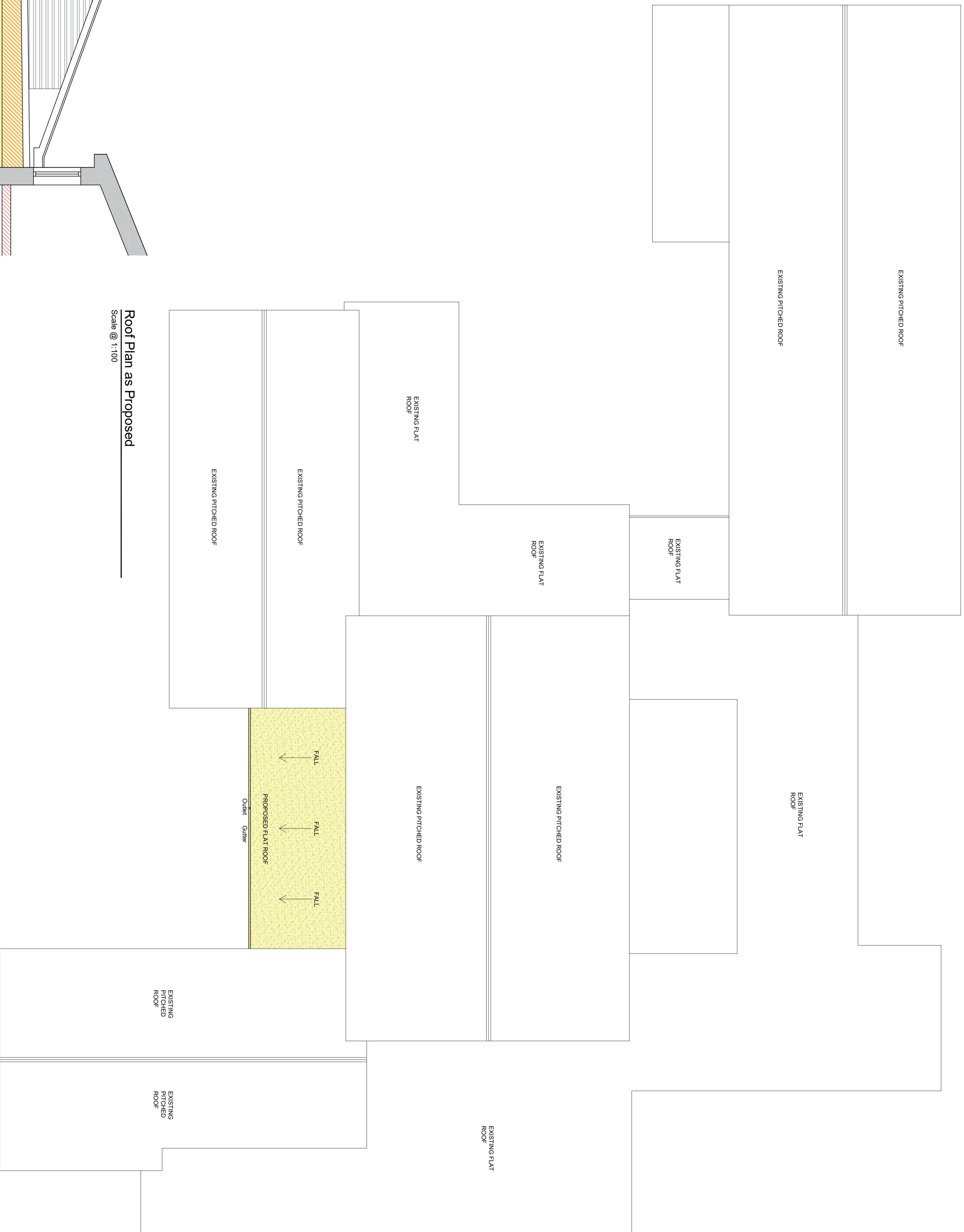
Roof Plan as Proposed Scale @ 1:100