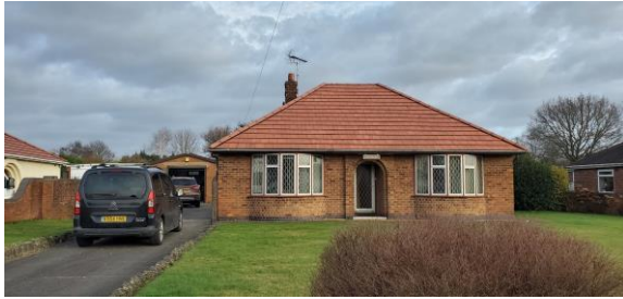
1 Front – south west aspect