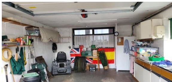
13 Internal view of garage