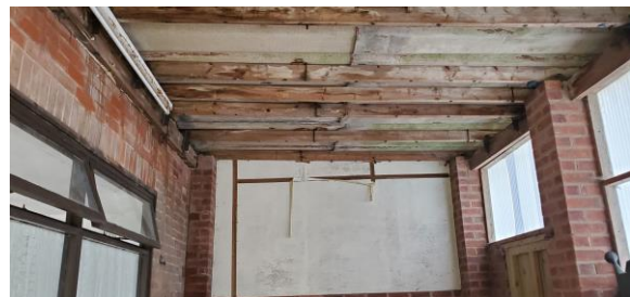
14 Internal view of garage addition