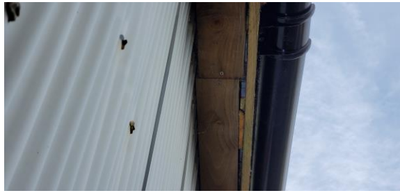
9 Gaps at soffit on the garage addition