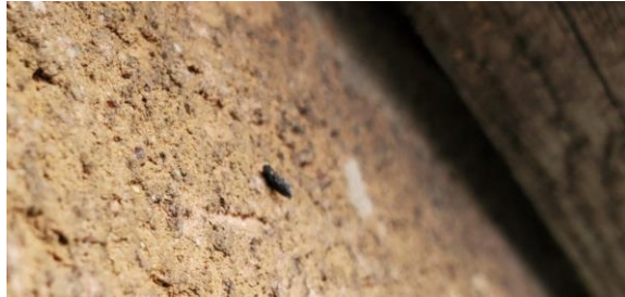
11 Bat dropping on garage gable wall