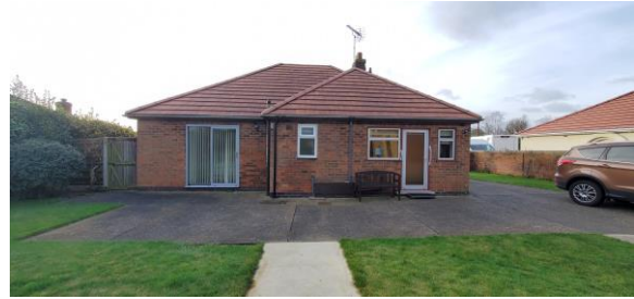
2 Rear – north east aspect