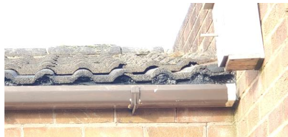
8 Gaps under roof tiles on garage