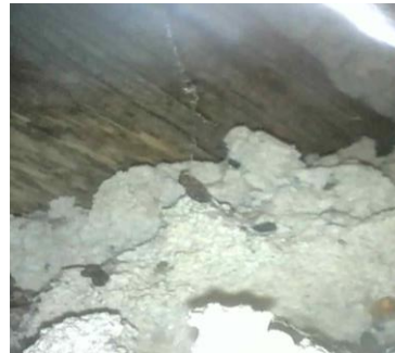
12 Bat droppings on wall plate