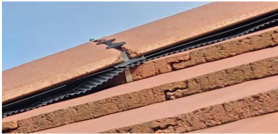
3 Example gaps between elements of the dry fit ridge system