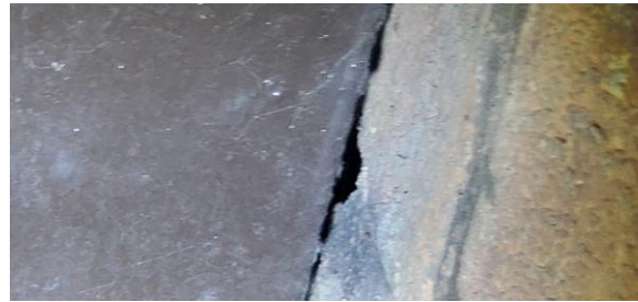
4 Gap at soffit