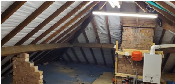
5 Internal view of loft