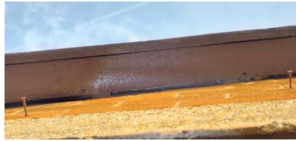
10 Gap under soffit at garage gable