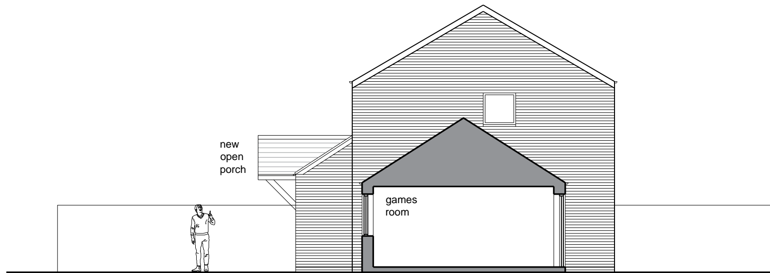
02 - ELEVATION - SW PROPOSED