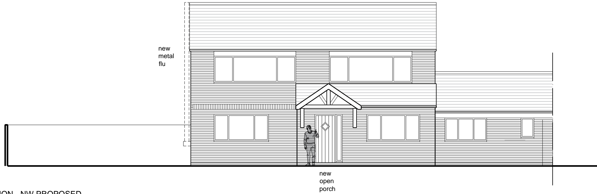
01 - ELEVATION - NW PROPOSED